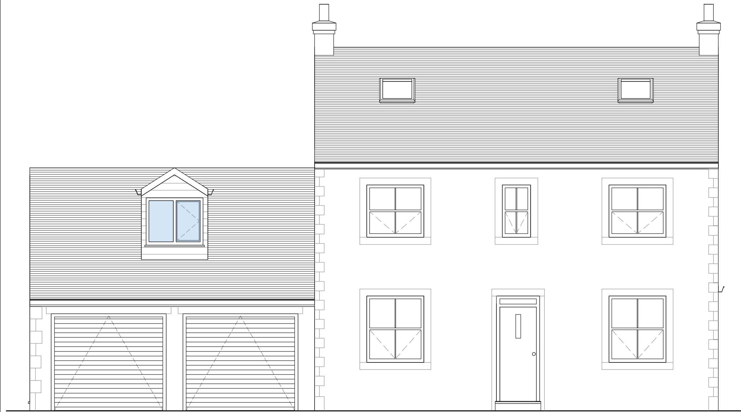
Proposed Front Elevation 1 : 50