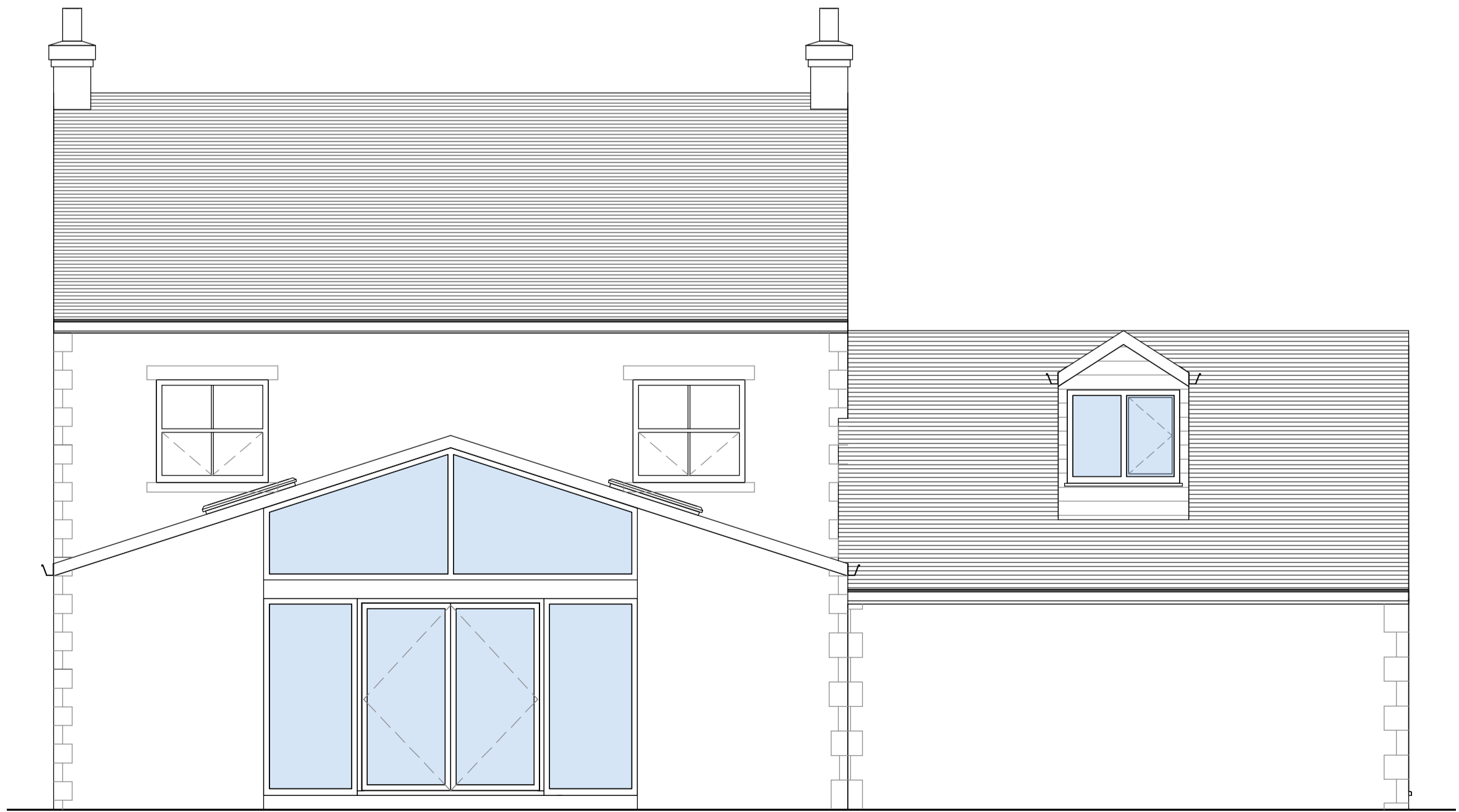
Proposed Rear Elevation 1 : 50