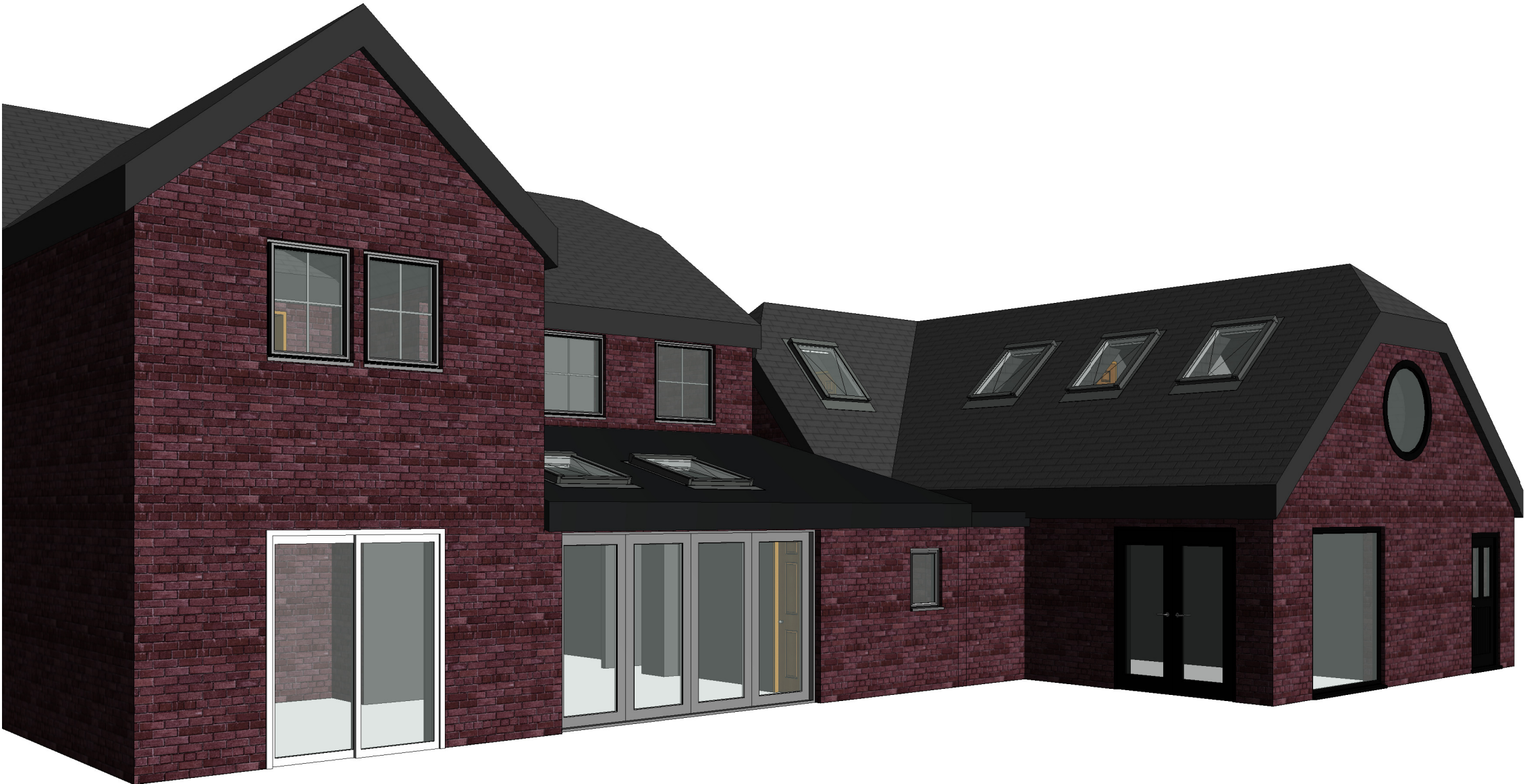
2 REAR 3D VIEW