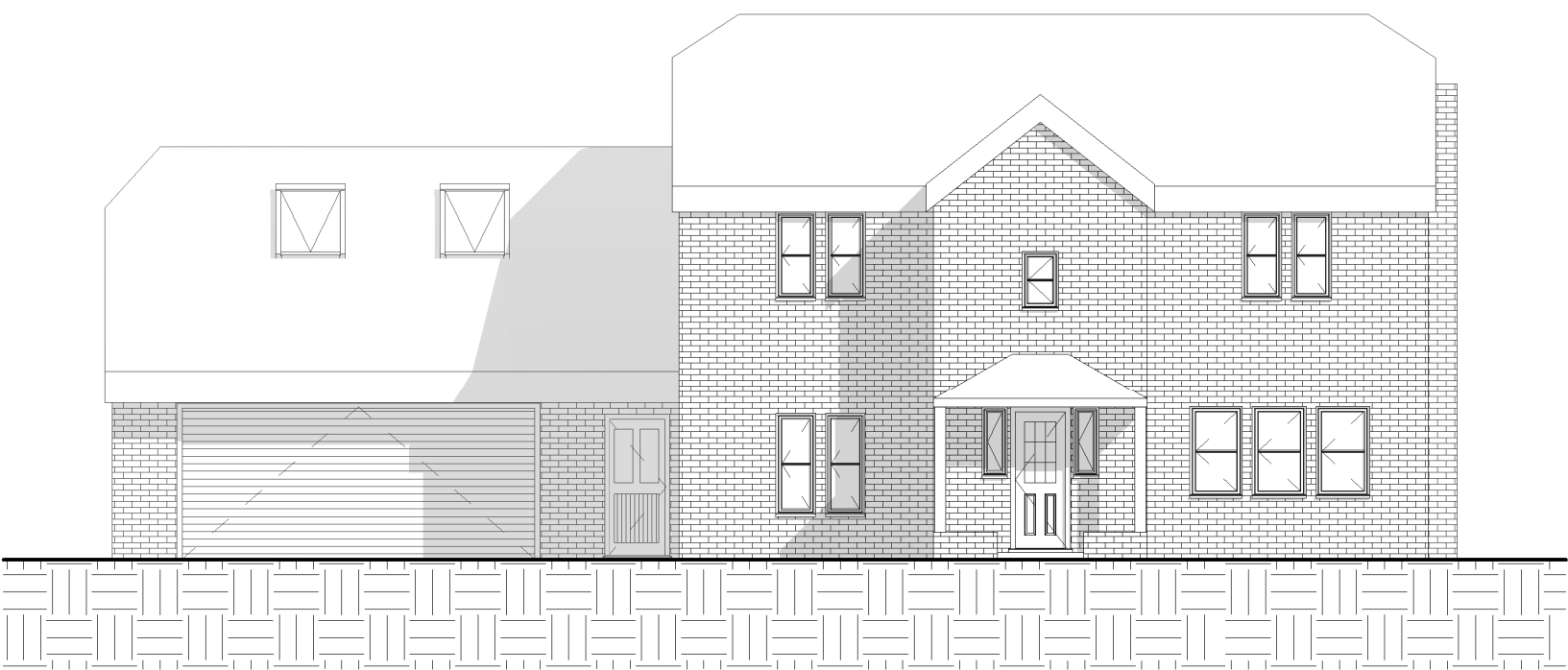
4 PROPOSED EAST 1 : 100