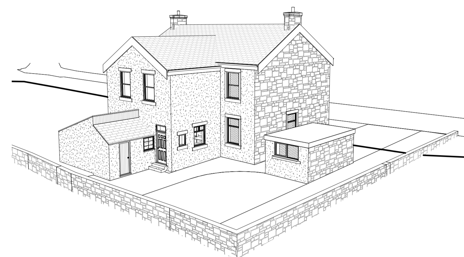
4 3D View 1