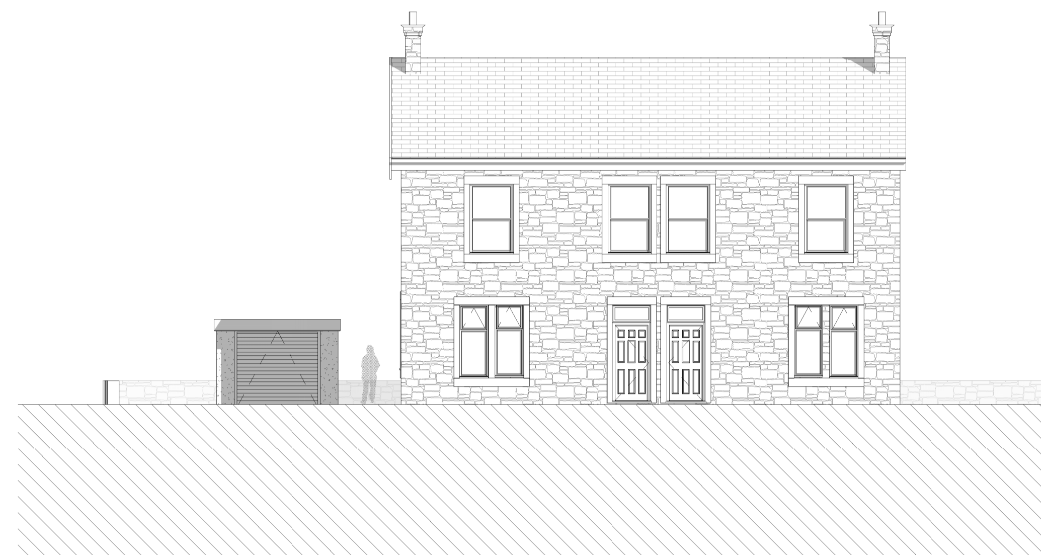
1 EXISTING NORTH WEST 1 : 100