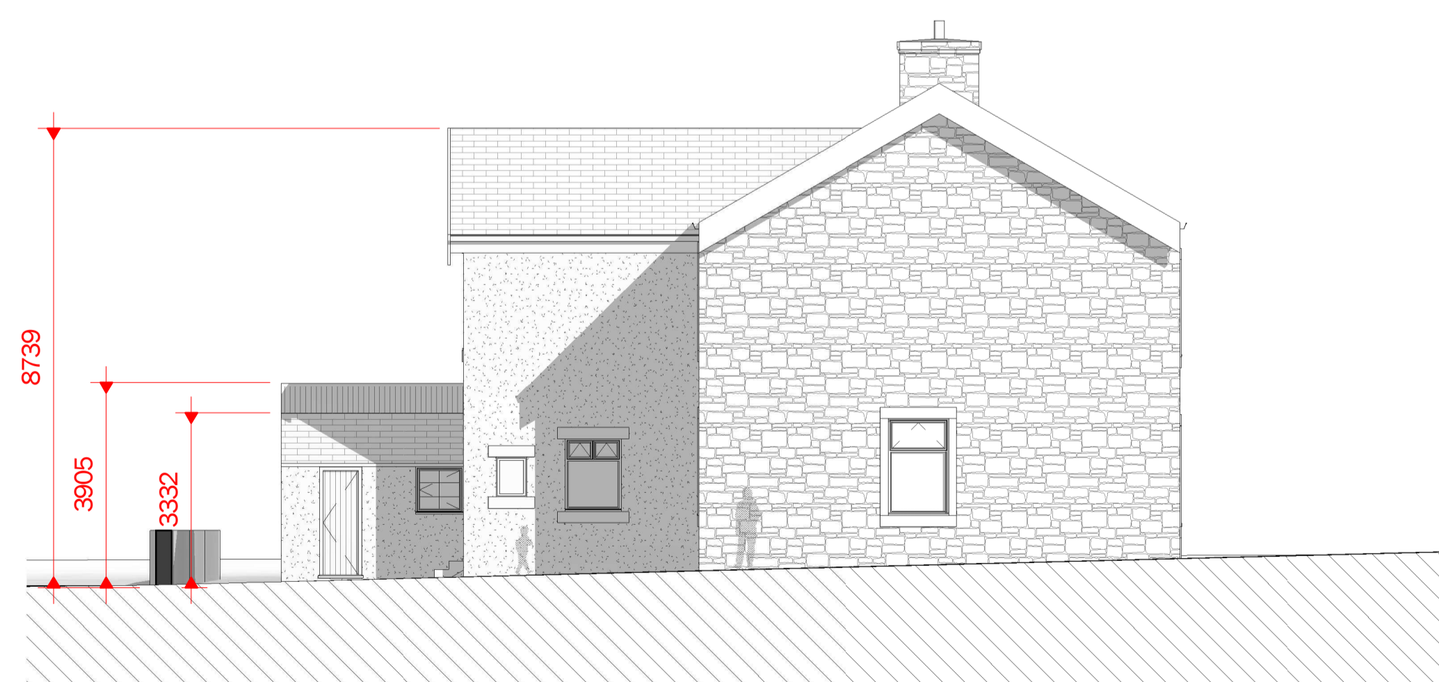
2 EXISTING NORTH EAST 1 : 100