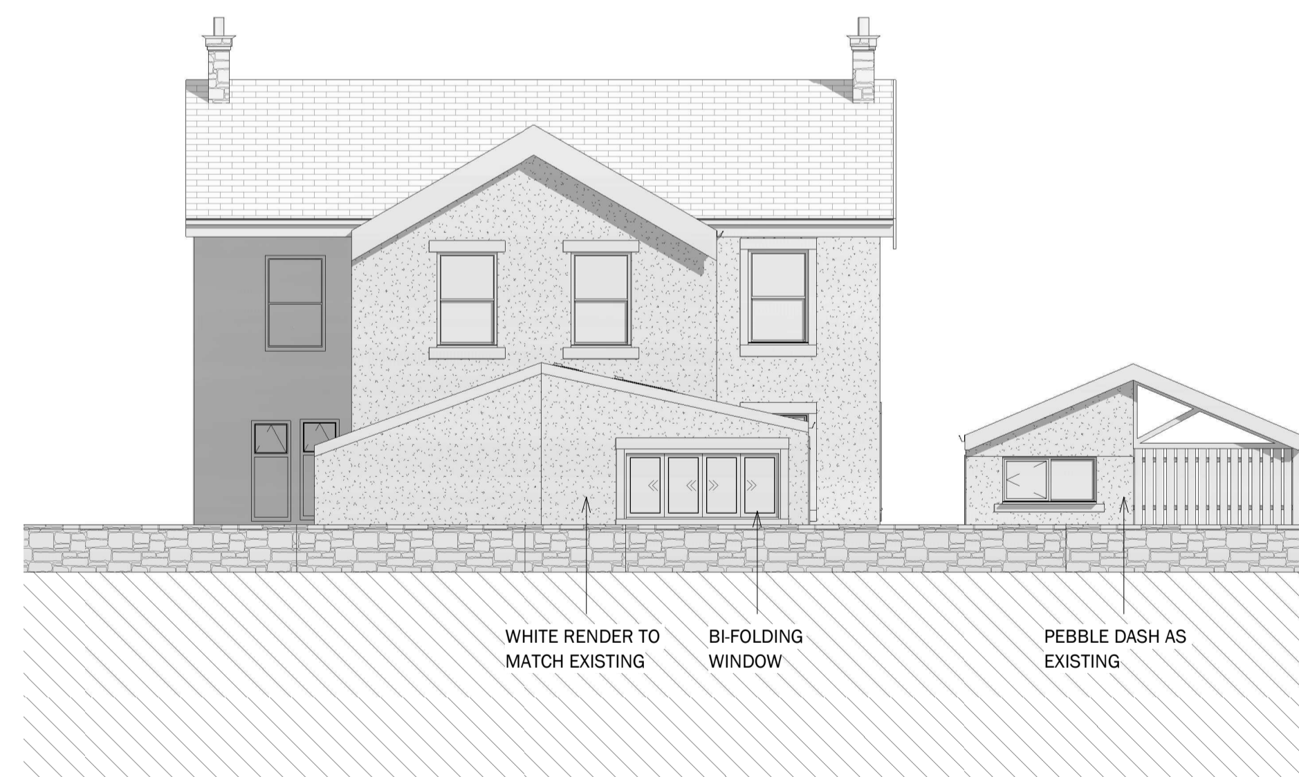
3 PROPOSED SOUTH EAST 1 : 100