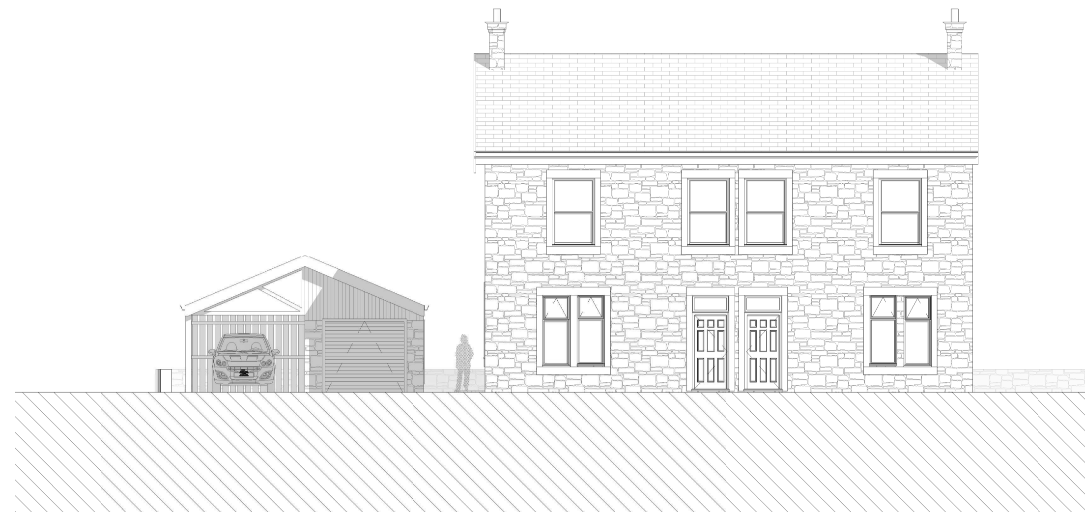
1 PROPOSED NORTH WEST 1 : 100