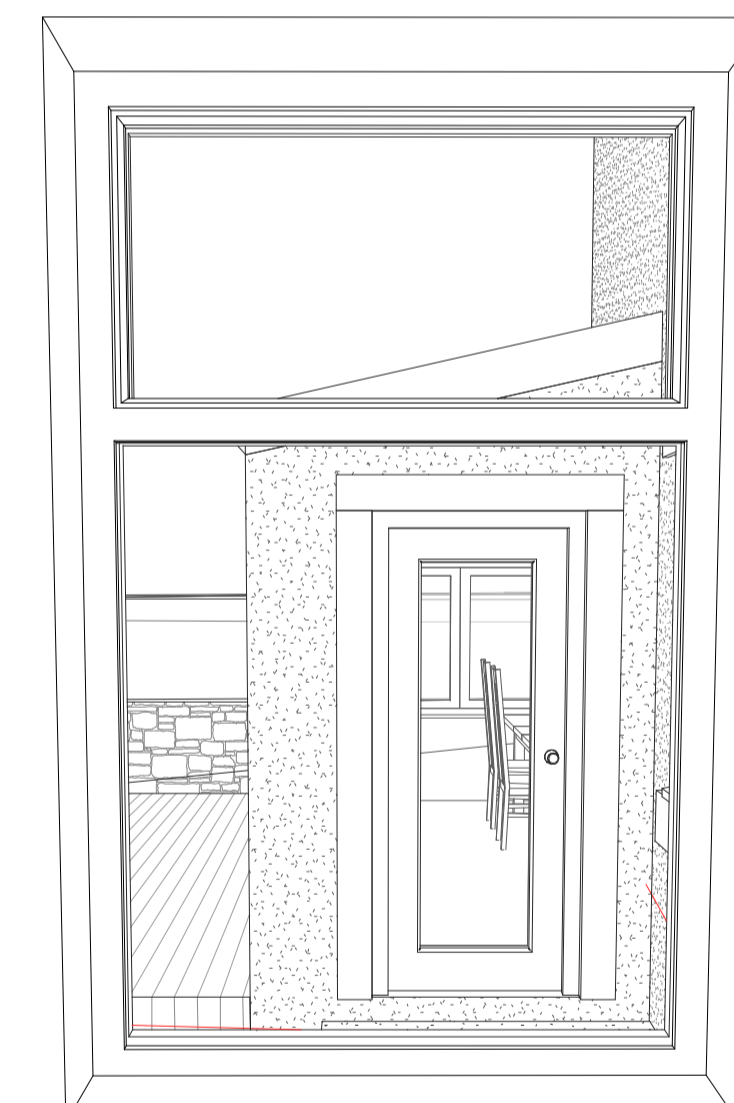
4 LOUNGE VIEW