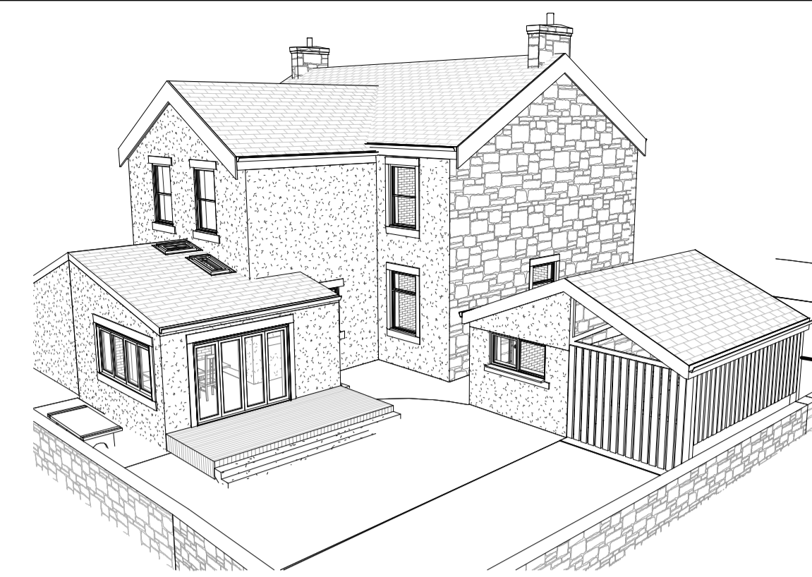
2 3D View 3