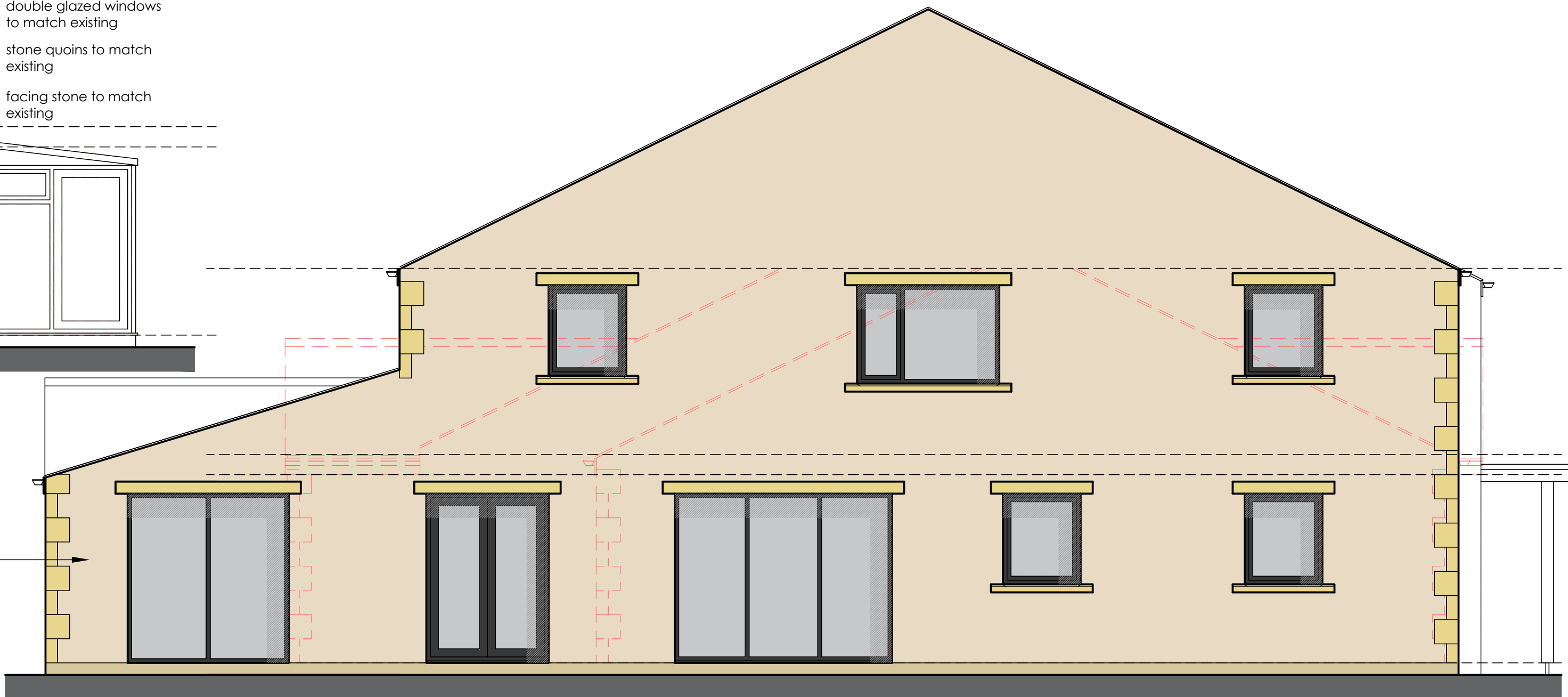
proposed side elevation