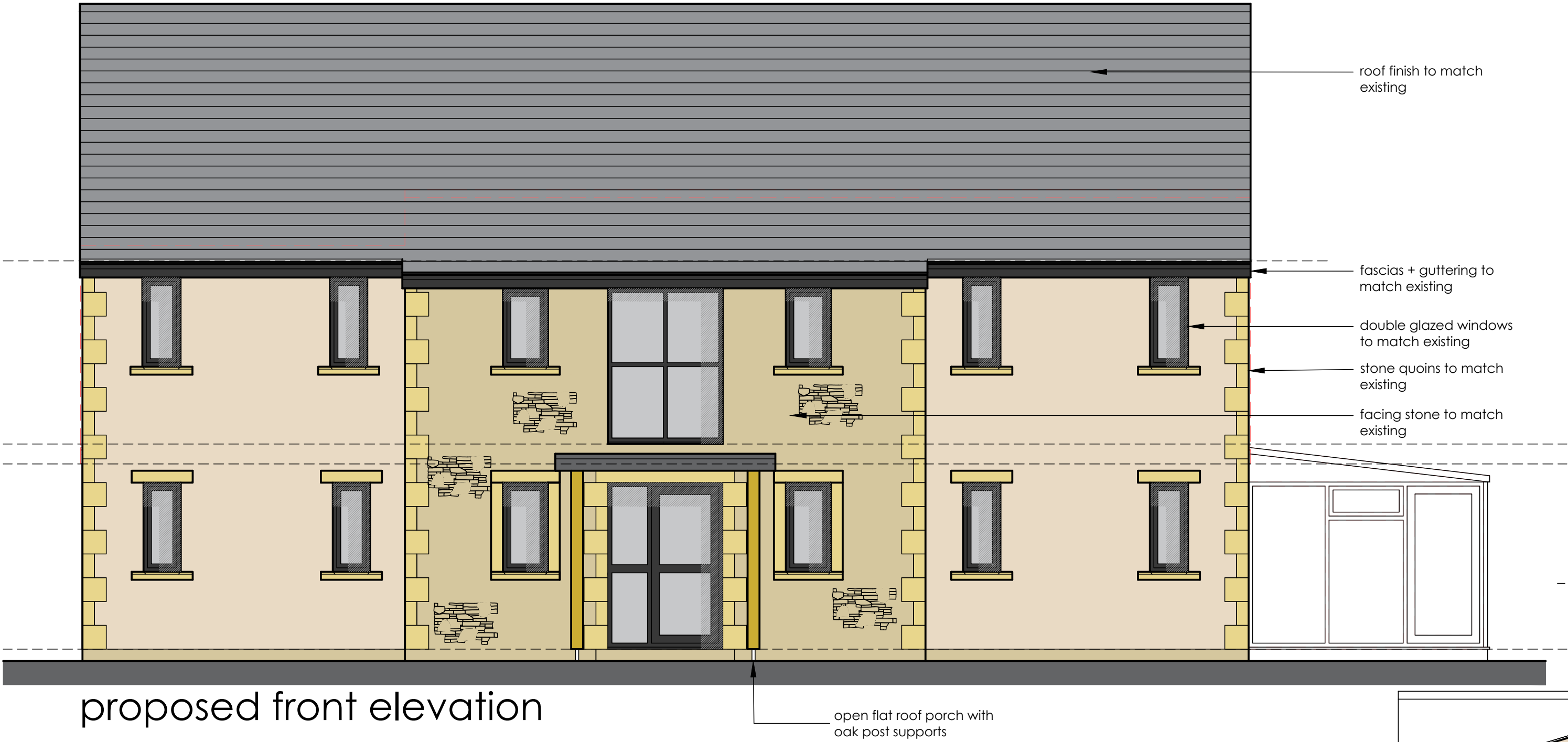
proposed front elevation

all dimensions to be checked on site prior to the commencement of any work being carried out. any discrepancies to be reported & resolved prior to work commencing.