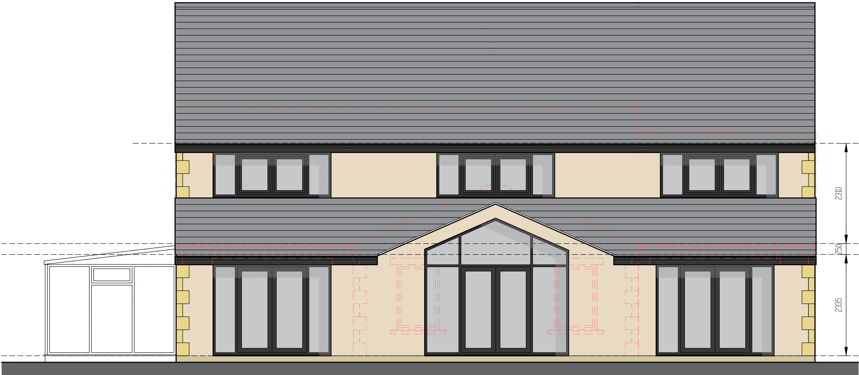
proposed rear elevation