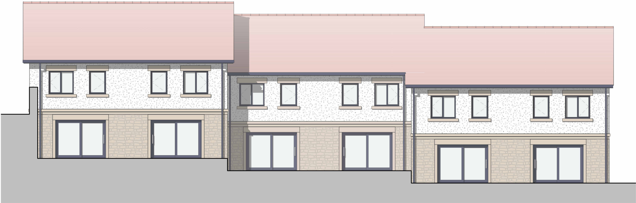
North West (Rear) Elevation

NOTES: 1: Do not scale this drawing, use figured dimensions only 2: The Contractor, Sub Contractor or specialist supplier are responsible for confirming site dimensions prior to fabrication 3: Any dimensional discrepancies are to be reported to the Architect immediately