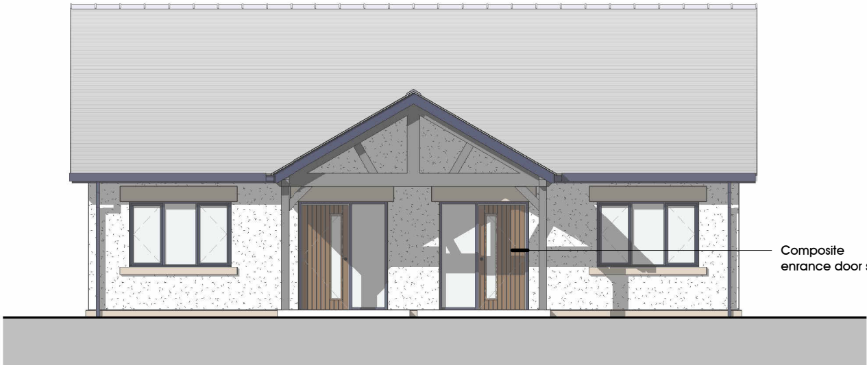
North West (Front) Elevation

NOTES: 1: Do not scale this drawing, use figured dimensions only 2: The Contractor, Sub Contractor or specialist supplier are responsible for confirming site dimensions prior to fabrication 3: Any dimensional discrepancies are to be reported to the Architect immediately