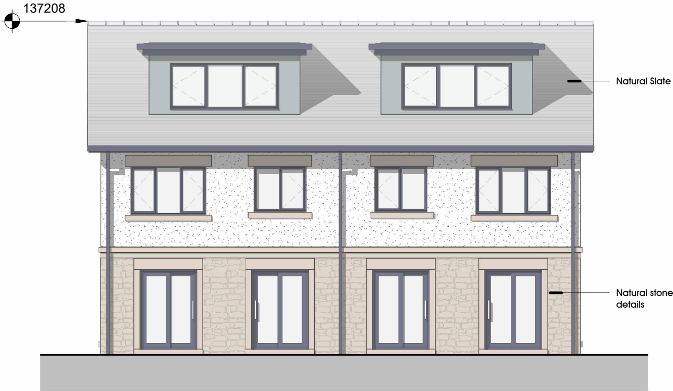
South East (Rear) Elevation