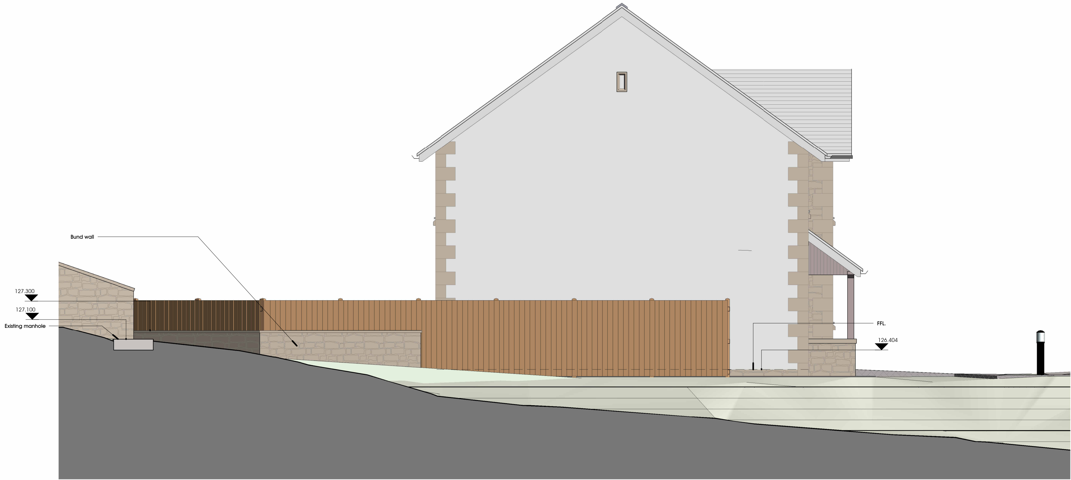
Longditudinal Section along runoff path 1 : 50