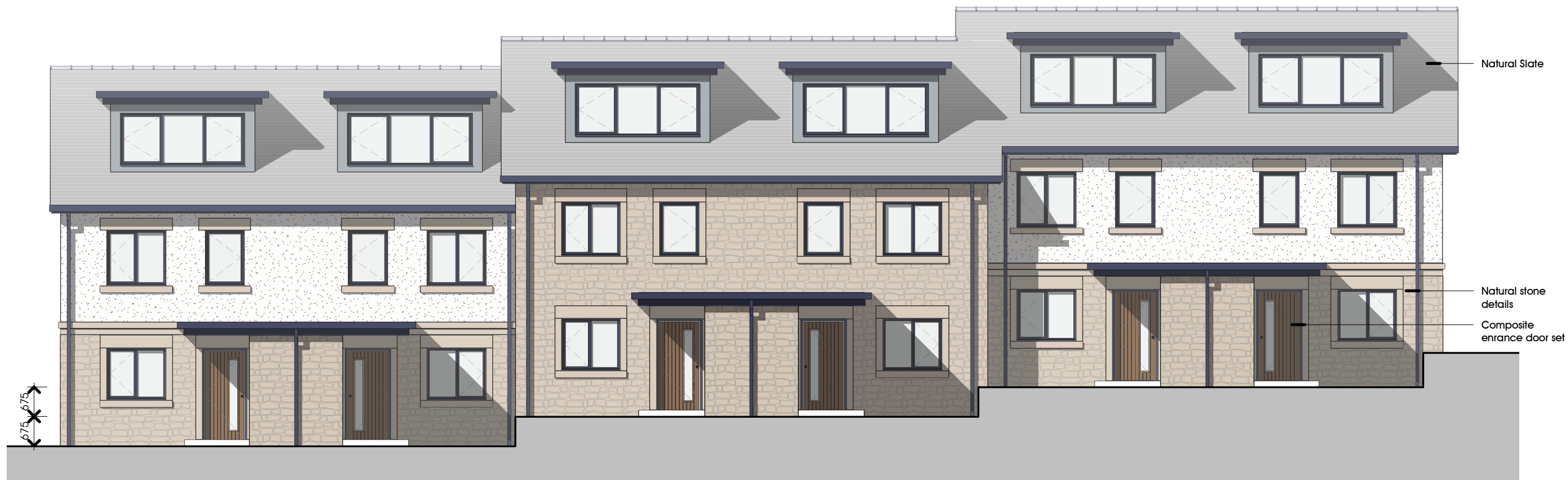
South East (Front) Elevation

1: Do not scale this drawing, use figured dimensions only 2: The Contractor, Sub Contractor or specialist supplier are responsible for confirming site dimensions prior to fabrication 3: Any dimensional discrepancies are to be reported to the Architect immediately