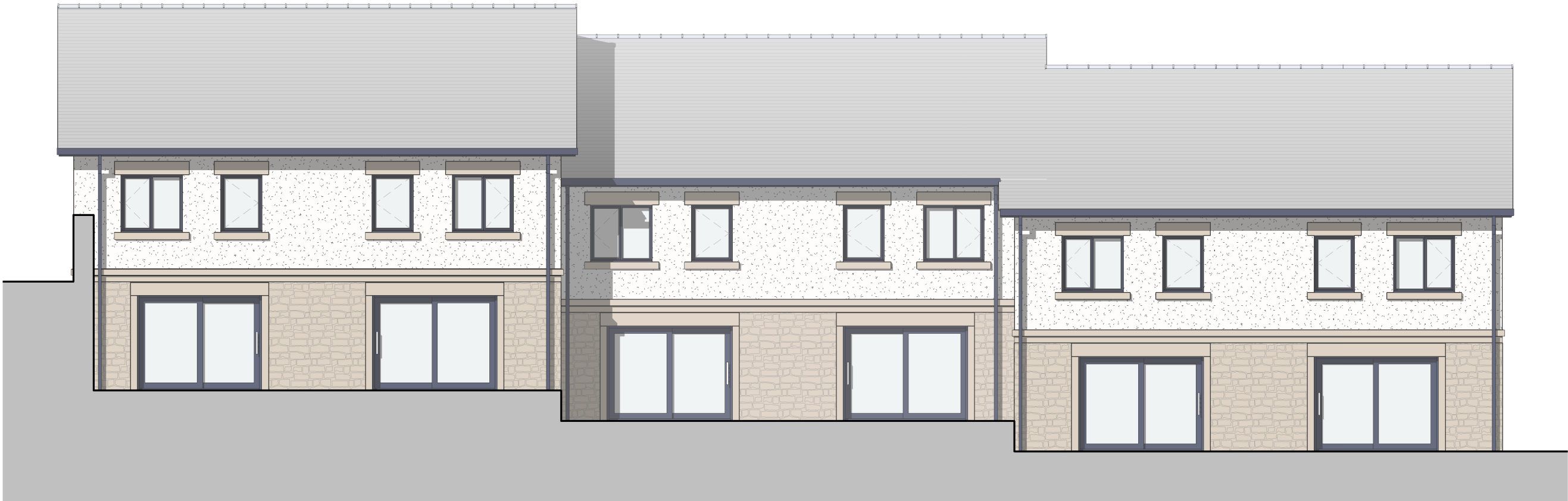
North West (Rear) Elevation

NOTES: 1: Do not scale this drawing, use figured dimensions only 2: The Contractor, Sub Contractor or specialist supplier are responsible for confirming site dimensions prior to fabrication 3: Any dimensional discrepancies are to be reported to the Architect immediately