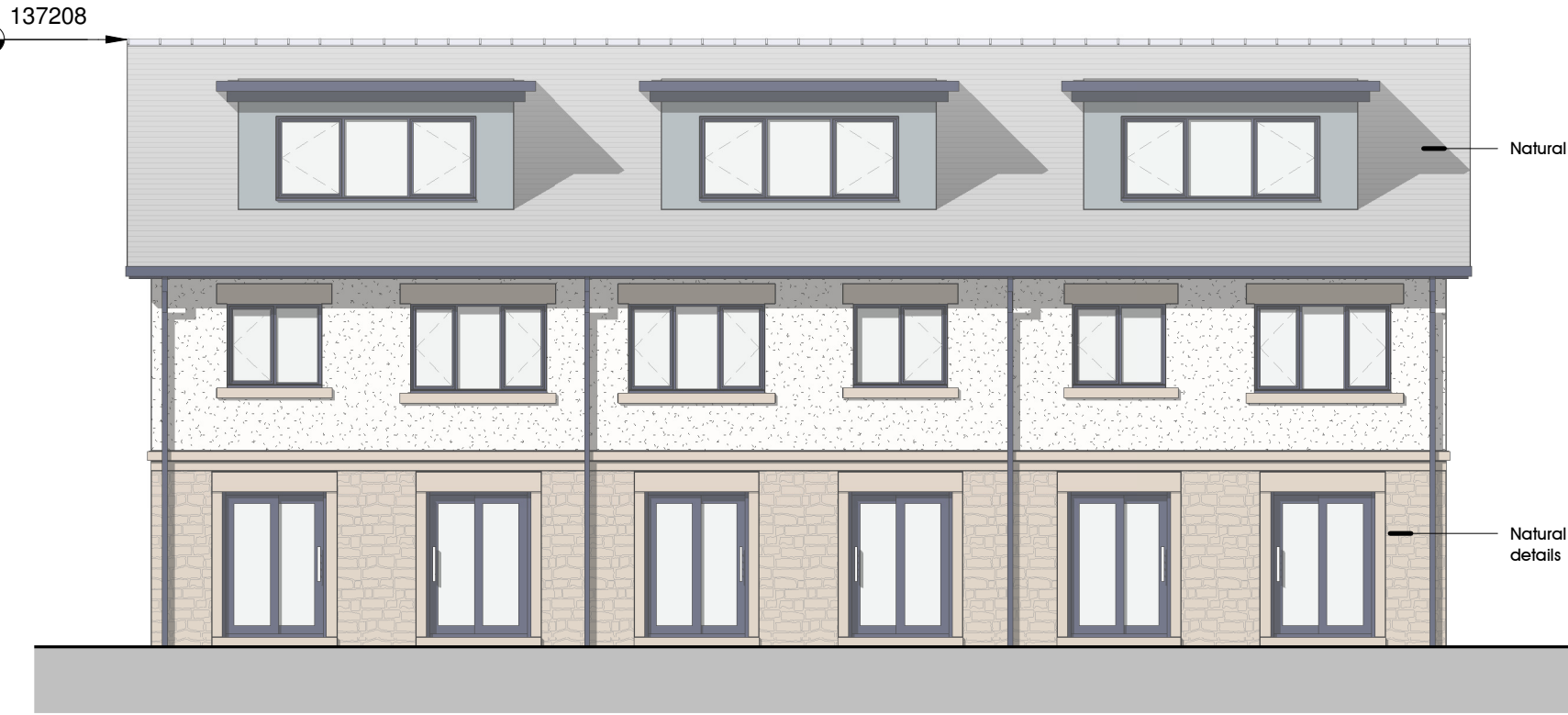
South East (Rear) Elevation