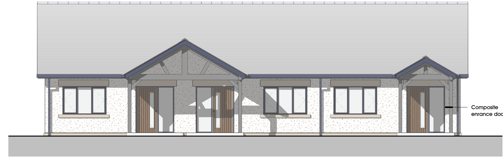
North West (Front) Elevation

NOTES: 1: Do not scale this drawing, use figured dimensions only 2: The Contractor, Sub Contractor or specialist supplier are responsible for confirming site dimensions prior to fabrication 3: Any dimensional discrepancies are to be reported to the Architect immediately