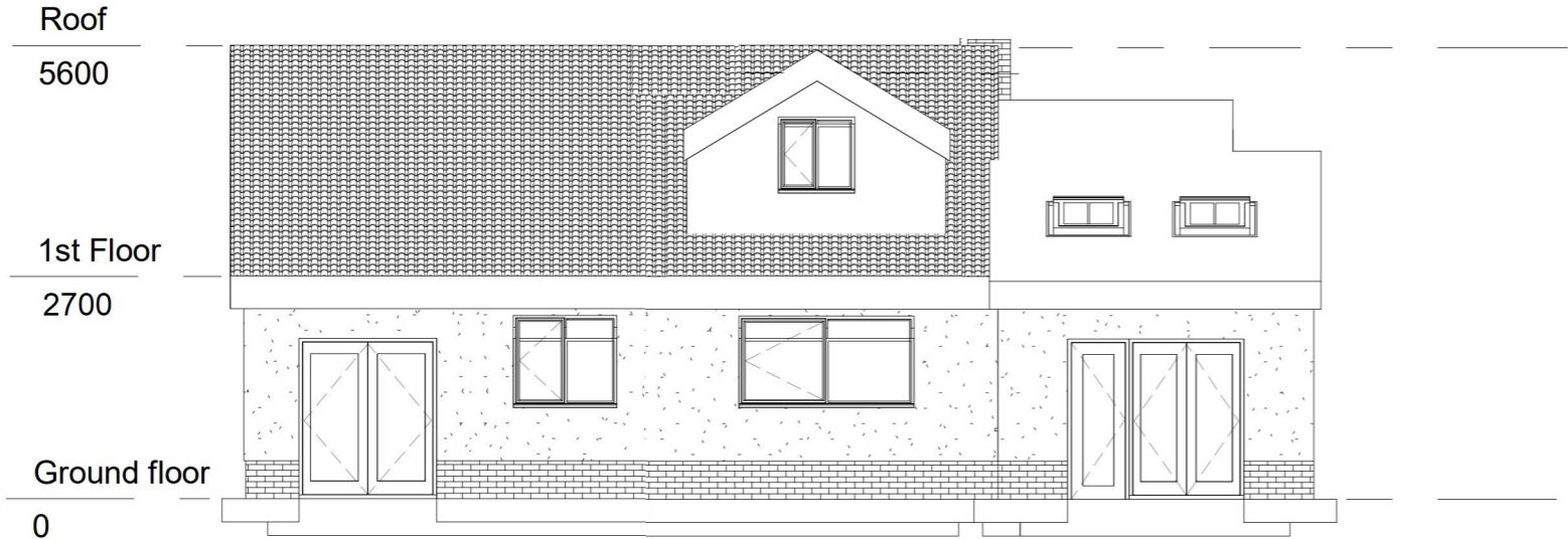
Proposed Rear Elevation (2)