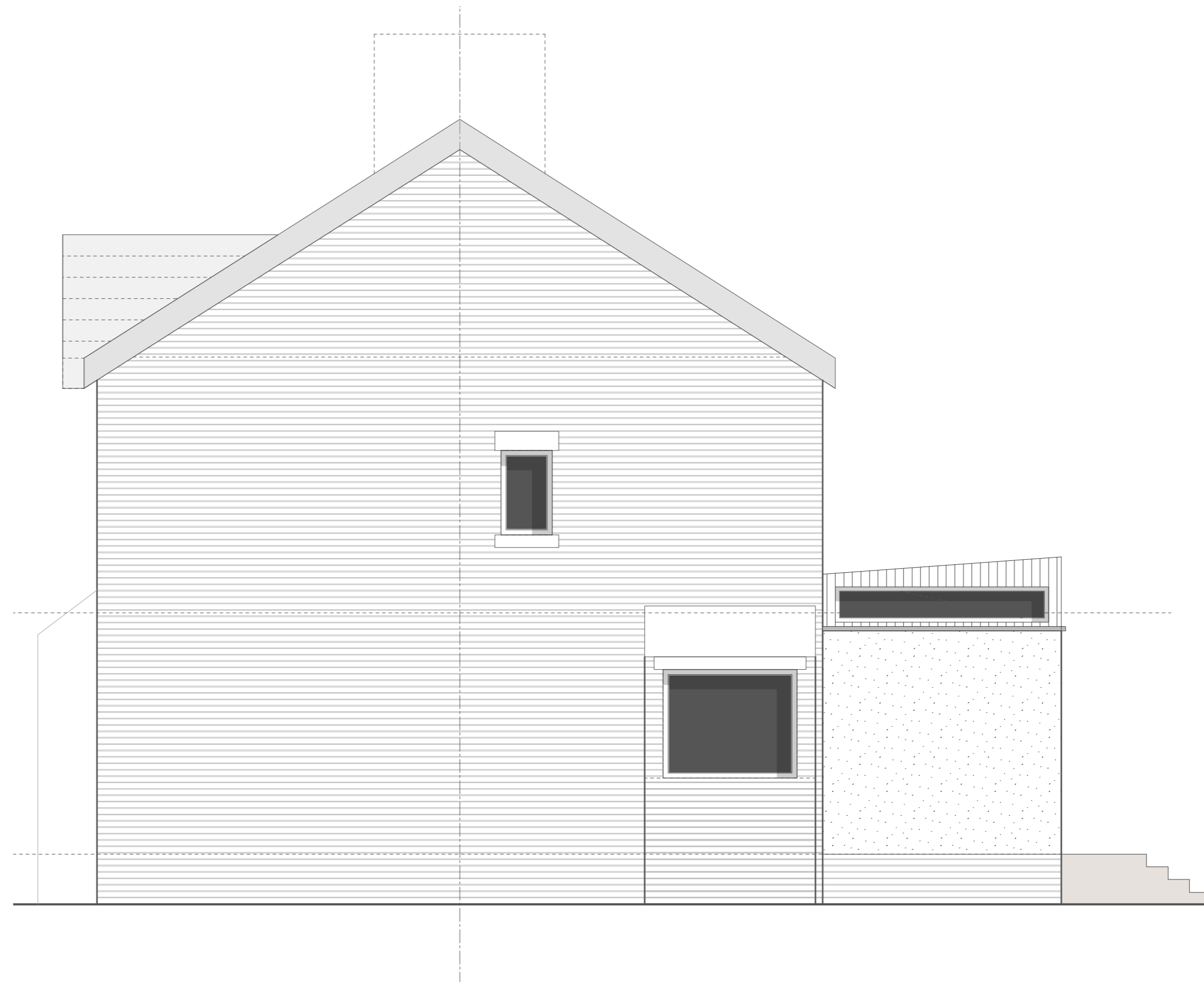
PROPOSED SIDE ELEVATION SCALE - 1:50 @A2