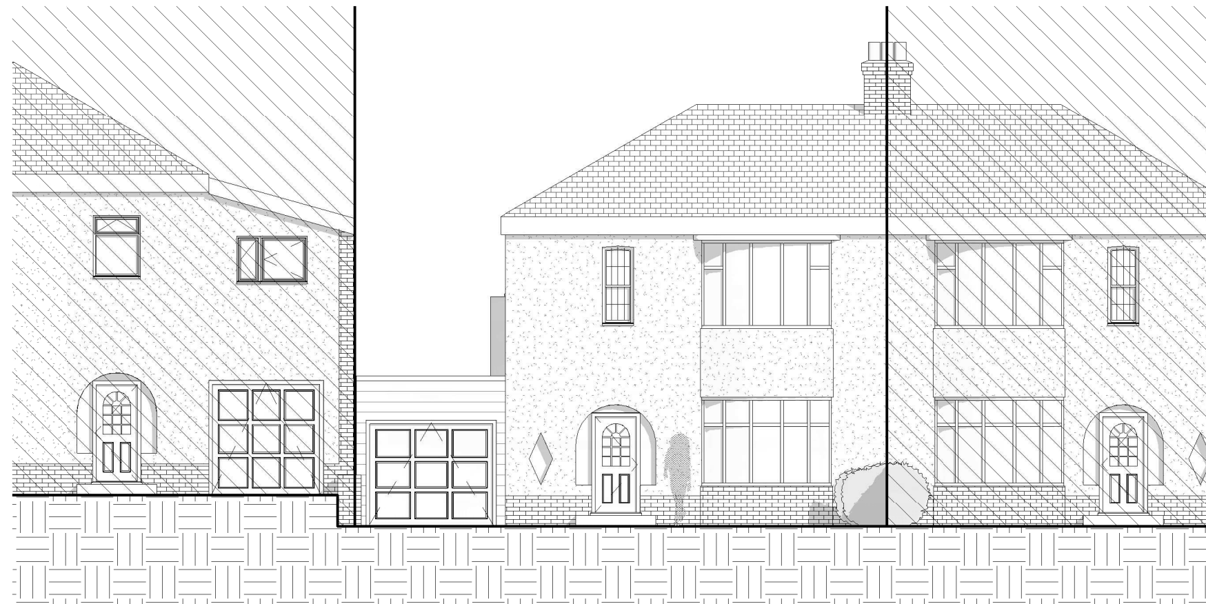
2 EXISTING NORTH/EAST 1 : 100