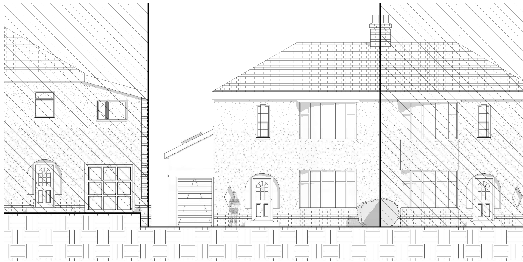
2 PROPOSED NORTH/EAST 1 : 100