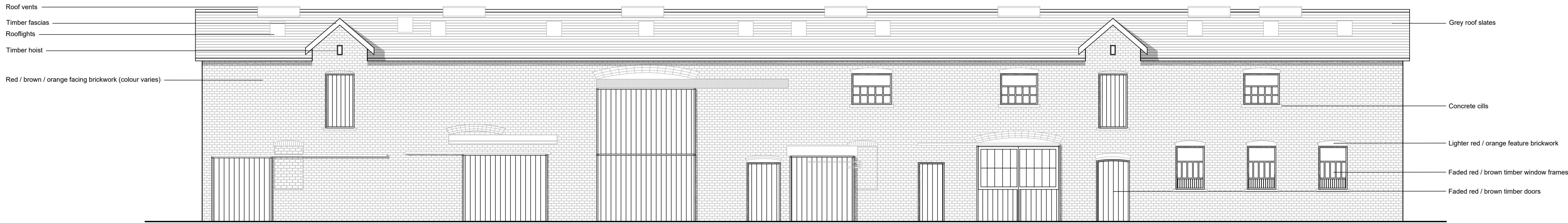
Existing North Elevation Scale 1:100