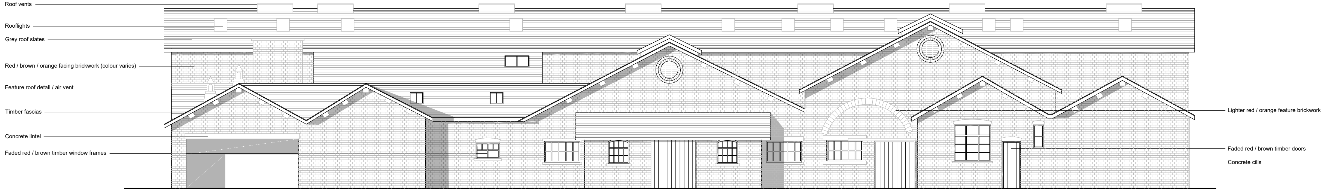
Existing South Elevation Scale 1:100