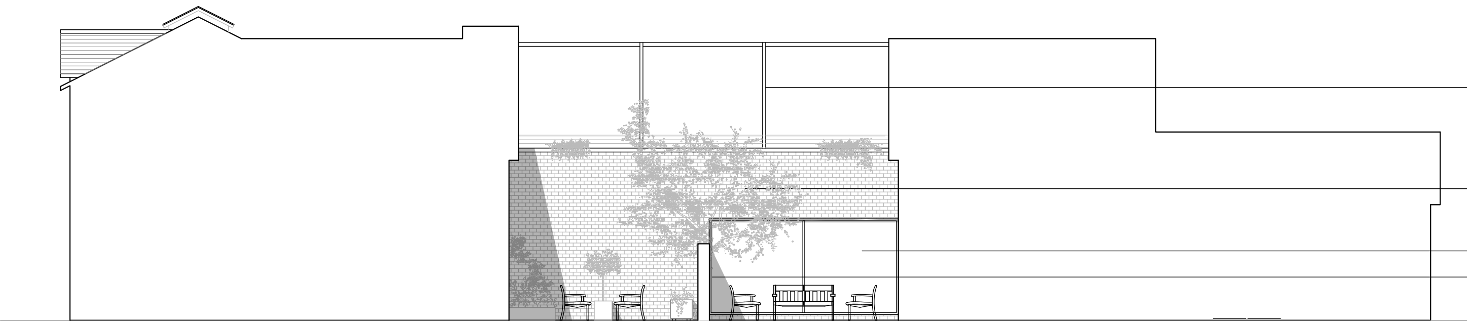
Proposed East Courtyard Elevation E Scale 1:100

Roof of barn structure to be removed above the courtyard, to create additional open courtyard space. External space is divided into private external courtyard spaces for each property. Steel frame can remain with with hanging planting into the courtyard below.