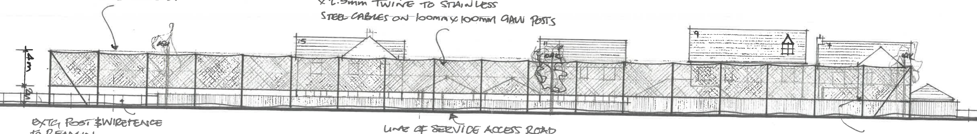
PROPOSED ELEVATION VIEWED FROM THE 1 ST FAIRWAY.

SAFETY FENCE: BLACK NETTING WITH 20mm x 20mm APERTURE x 2.3mm TWINE TO STAINLESS STEEL CABLES ON 100mm x 100mm GALV POSTS