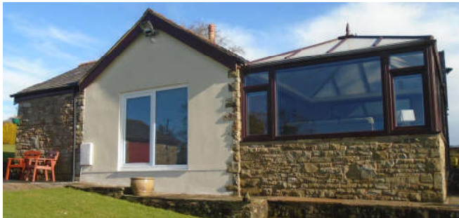
South West side elevation