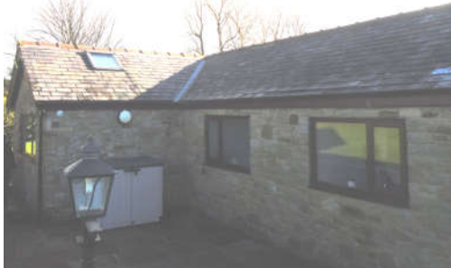
Part front elevation

Detached Bungalow possibly dating from the 1980's .