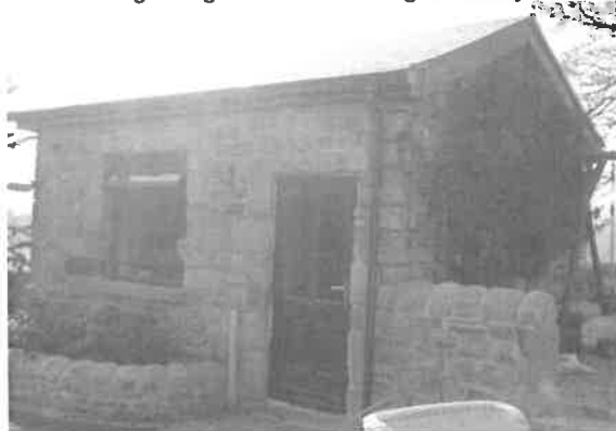
Front North elevation

The building is a garden outbuilding currently used for storage.