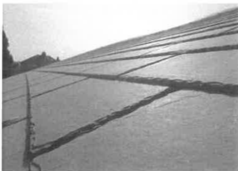
Artificial slate roof