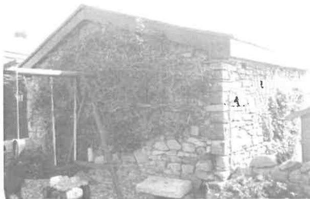
Side west elevation