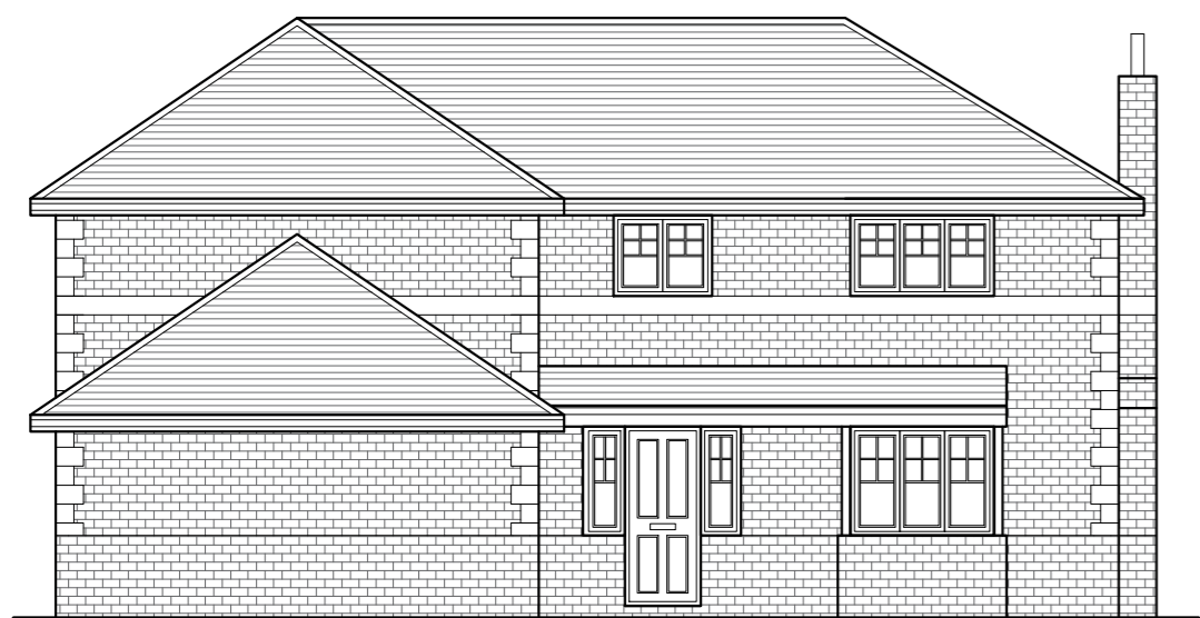
EXISTING SOUTH EAST FACING ELEVATION SCALE 1:100

This drawing is to be read in conjunction with all relevant Architect, consultants' and specialists' drawings and specifications. The Architect is to be notified of any discrepancies before proceeding. Do not scale from this drawing. All dimensions and levels are to be checked on site. This drawing is subject to copyright. All work carried out before Planning and Building Permission has been granted is at the contractor's risk. Note: Proposed drawing based on OS dvig information. All illustrated dimensions are approximate and all site dimensions are to be checked on site and subject to site survey.