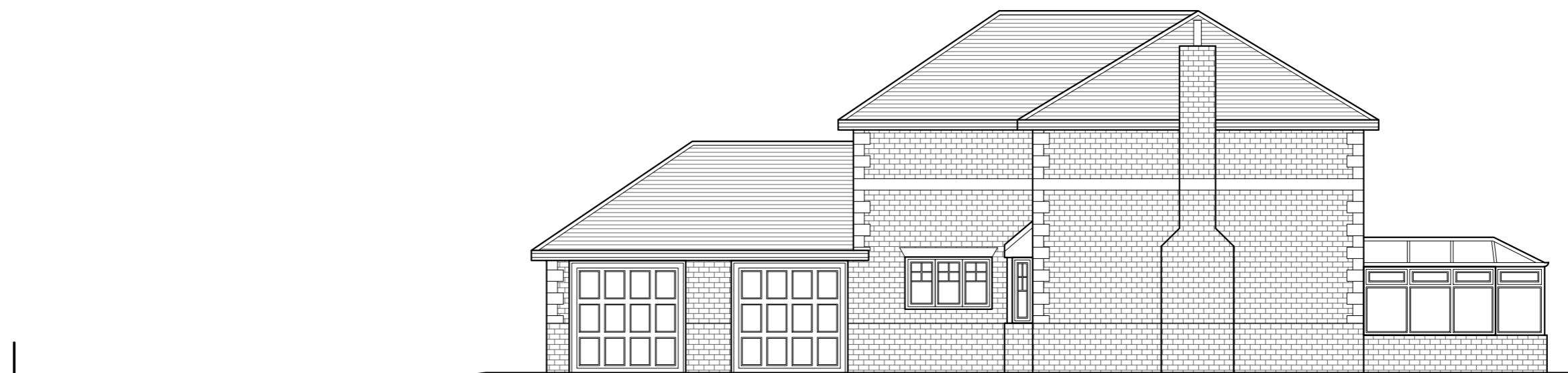
EXISTING NORTH EAST FACING ELEVATION SCALE 1:100