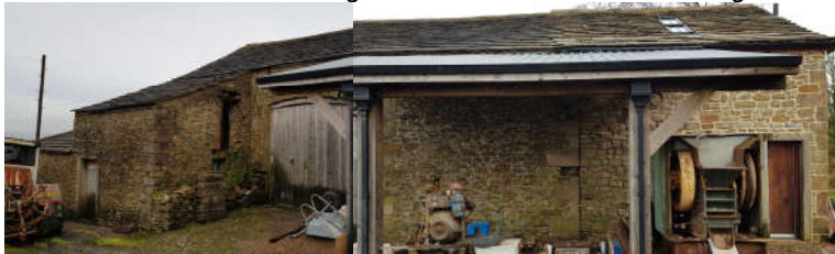
South west elevation

The building is a large stone detached Barn with grey slate roof. The South east end of the building has been re-roofed and the interior is being converted to form a 1 bed cottage.