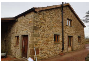
South east elevation