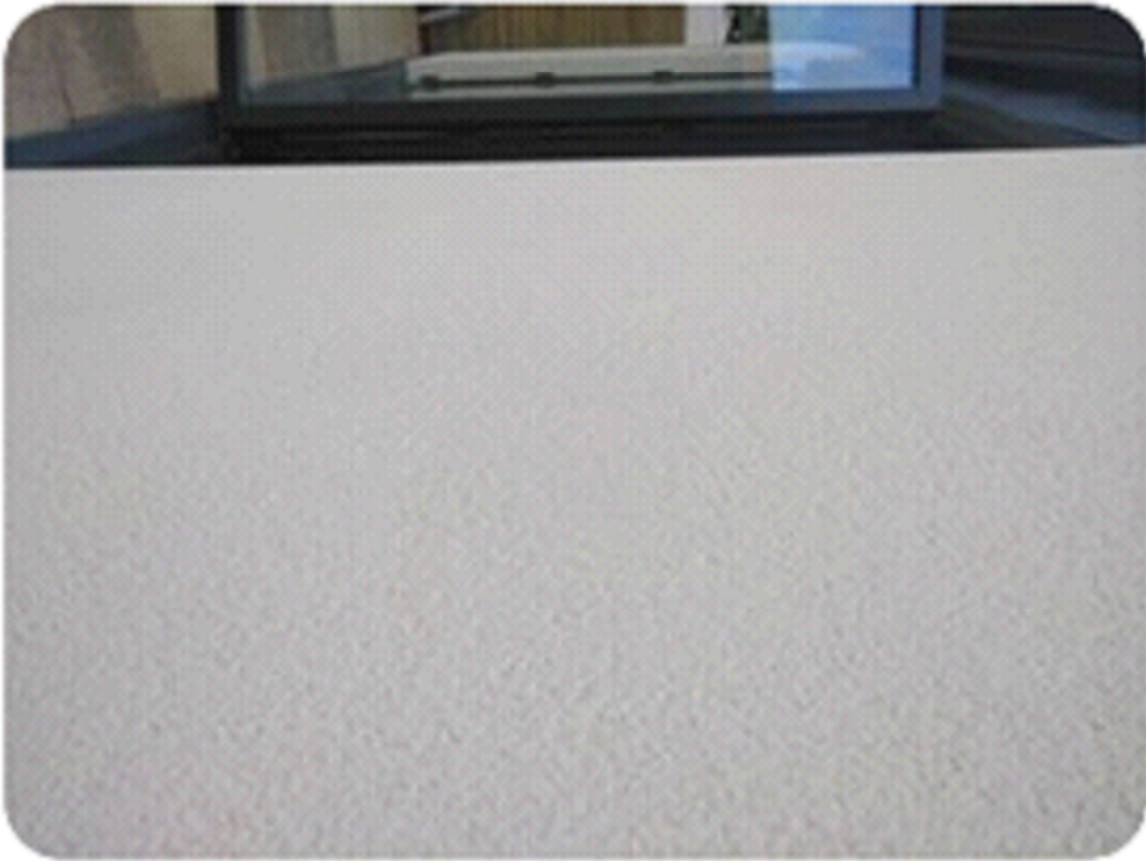
K-Rend Scraped Finish Render