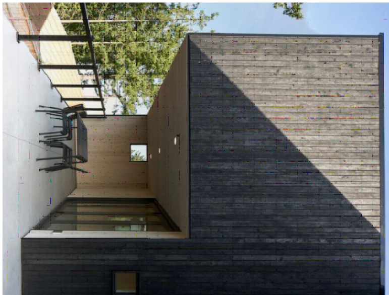
Burnt Larch Cladding