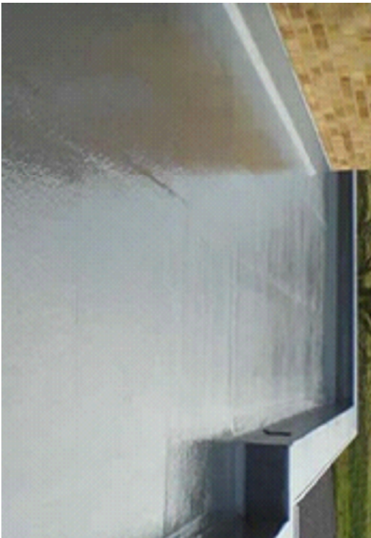
Polycrystalline GRP Flat Roof - Colour Dark Battleship Grey