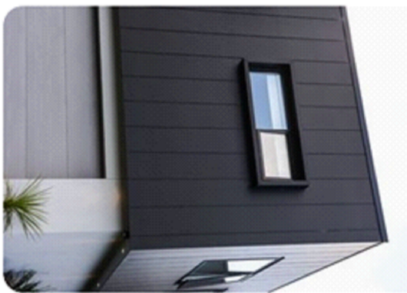
Wall cladding: Catnic - SR2 Standing Seam Cladding - To Entrance Canopy, steel colour coated (colour tbc).