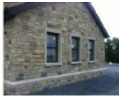
Stone window surrounds