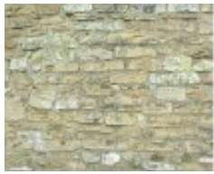
Random sandstone wall

The proposal will include a variety of materials which will take into consideration the local vernacular and the surrounding buildings that exist within the area.