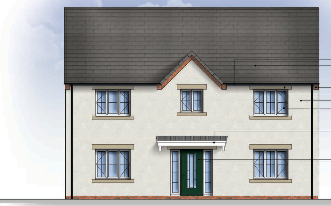
Blakeney Focal Point Typical Elevation