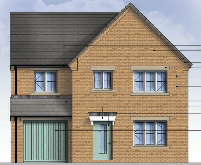
Buckland Green Edge Typical Elevation Buff brick