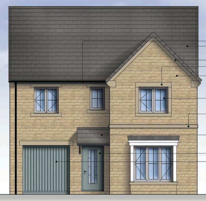
Mapleford Stone Edge Typical Elevation