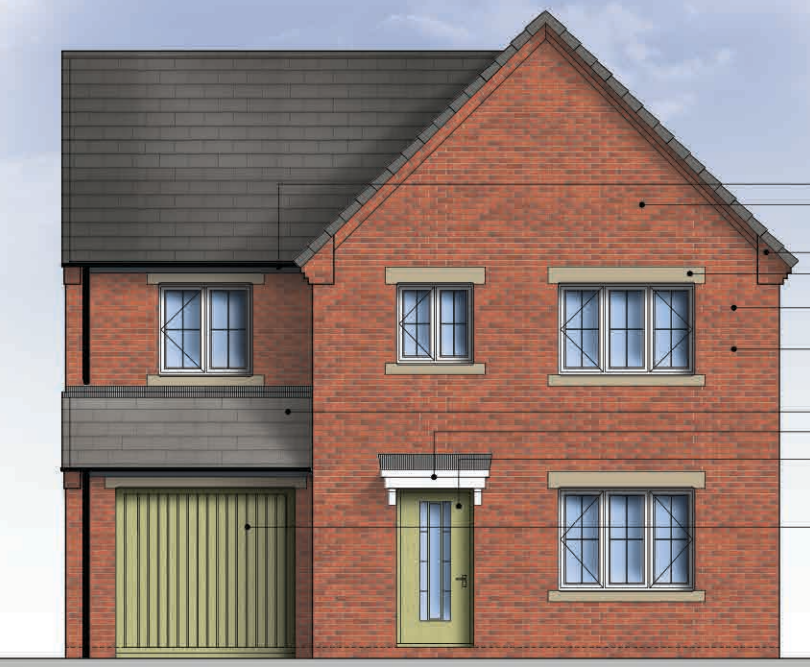
Buckland Green Edge Typical Elevation Red brick

Note: Due to brick shortage, changes may occur.