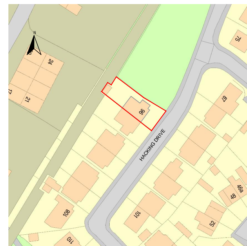
EXISTING LOCATION PLAN Scale 1:1250