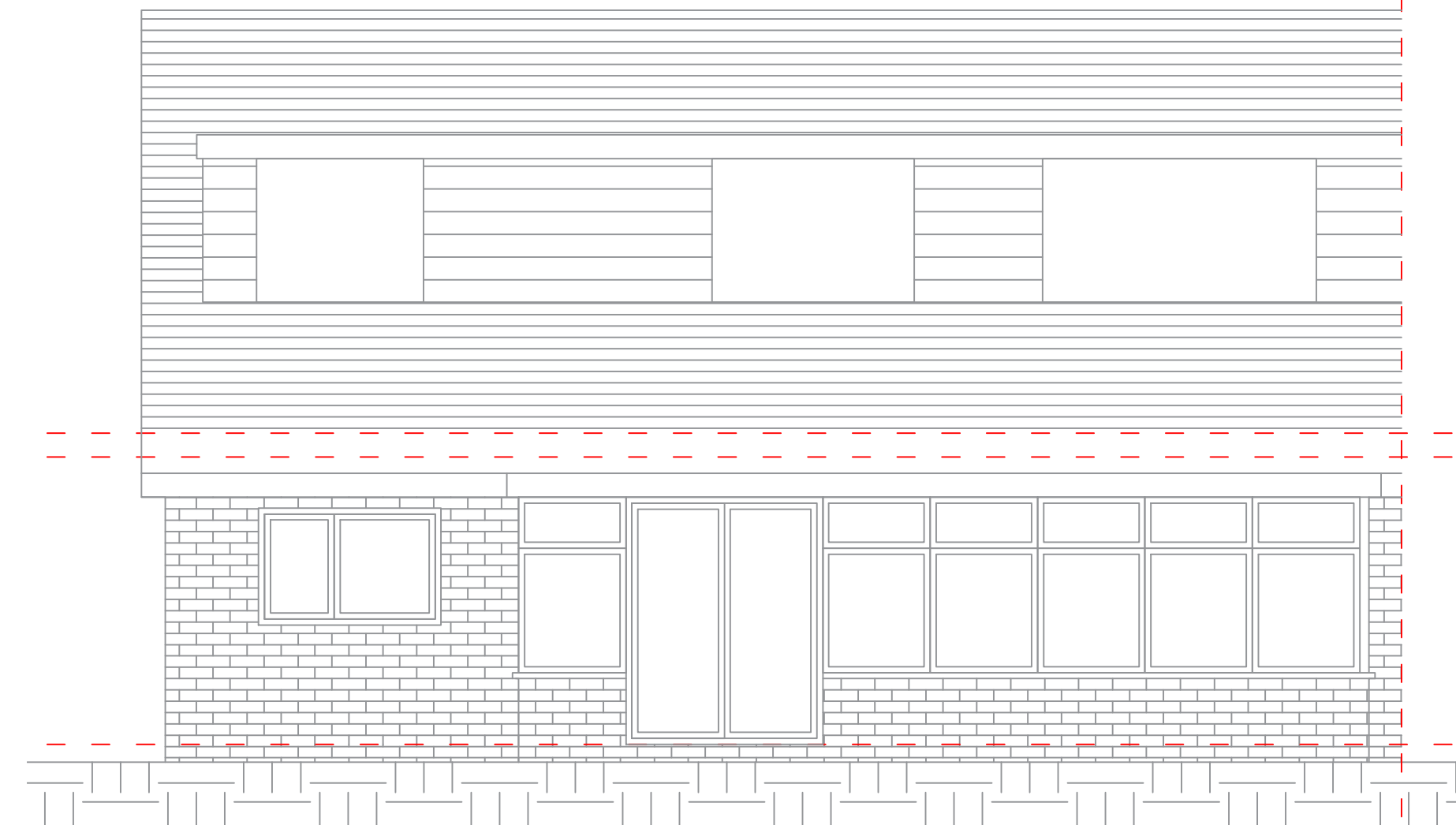
EXISTING REAR (NW) ELEVATION Scale 1:50