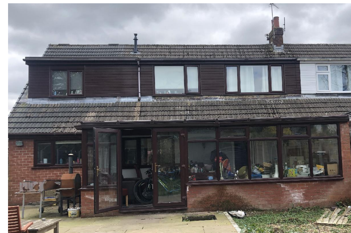
EXISTING FRONT OF HOUSE (image) Scale NTS