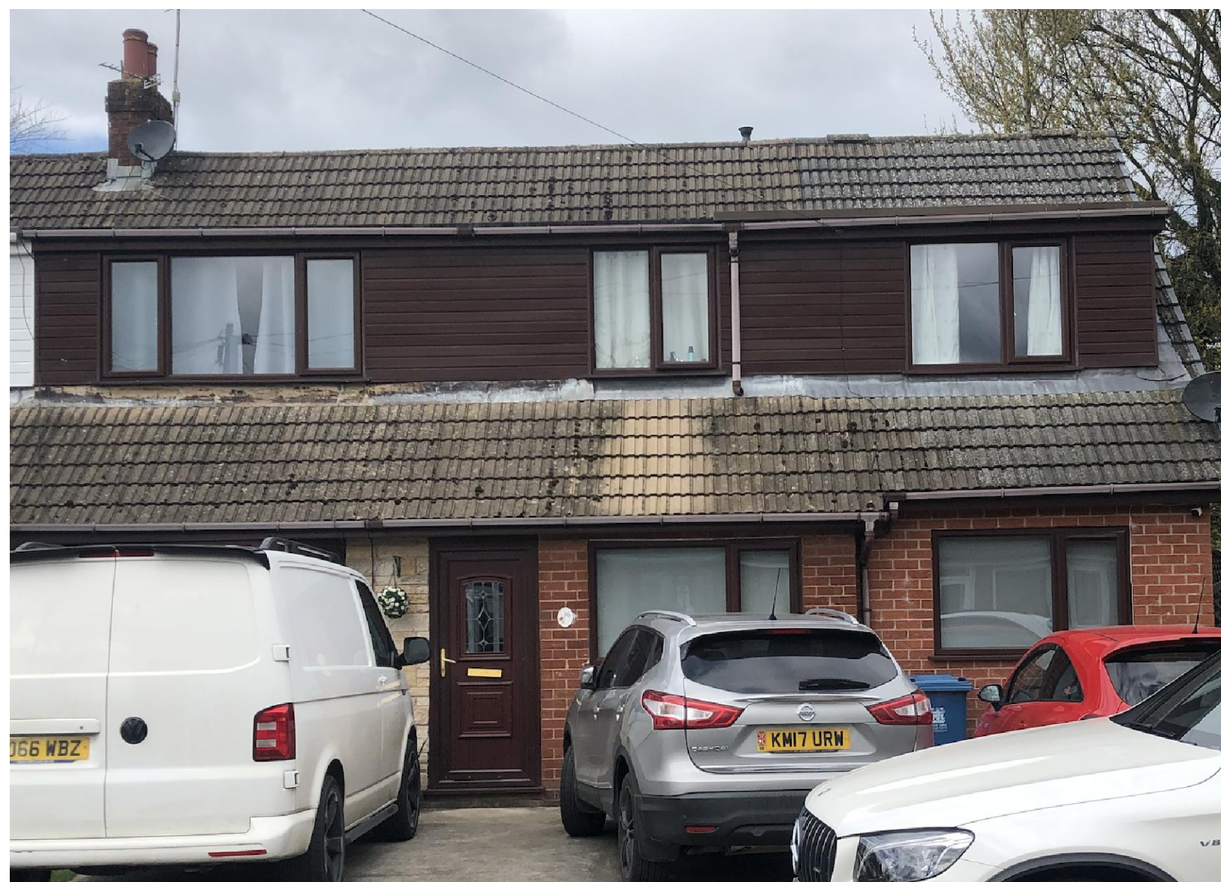
EXISTING FRONT OF HOUSE (image) Scale NTS