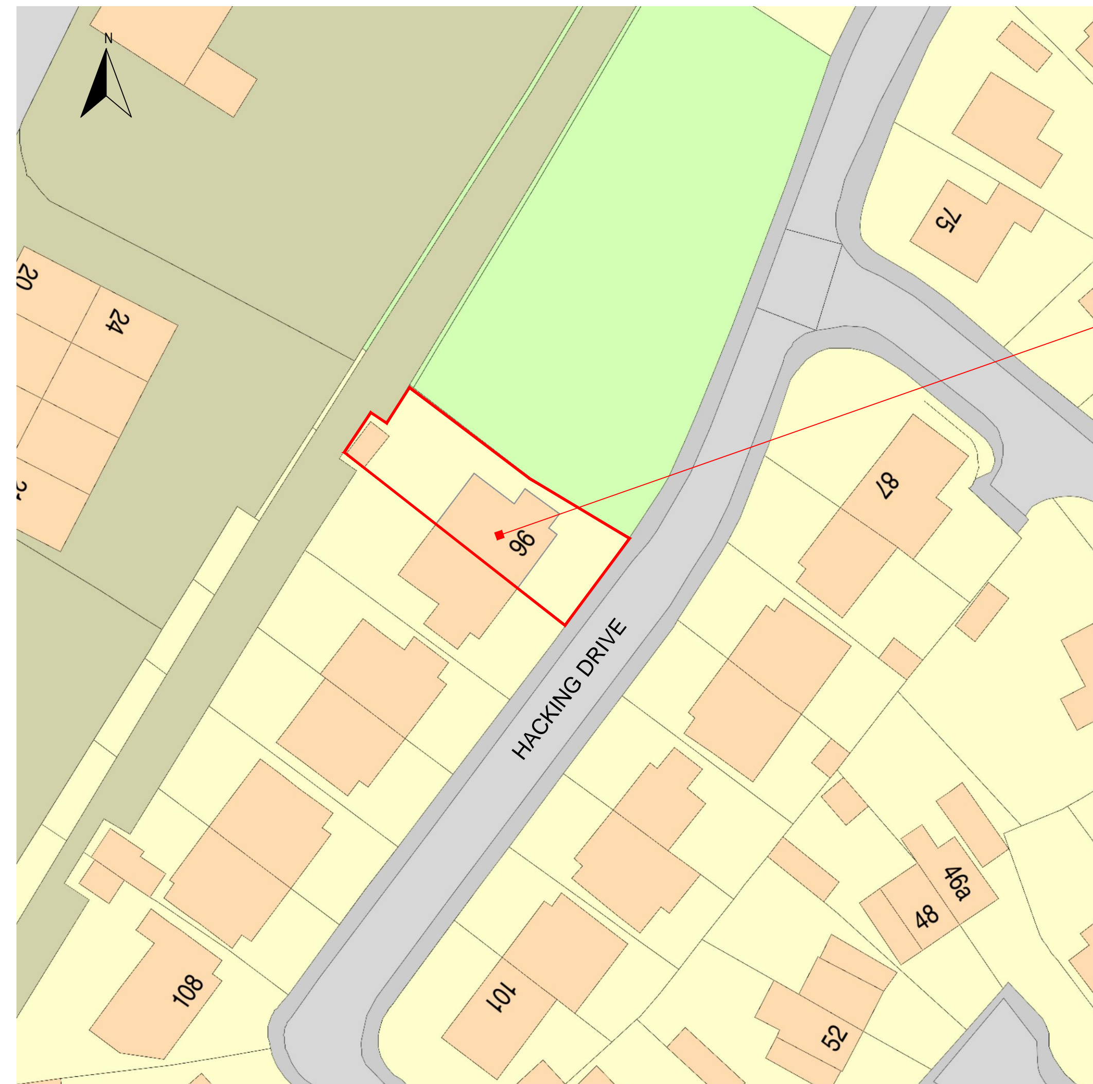
EXISTING SITE PLAN Scale 1:500