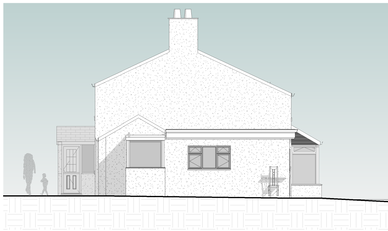
4 EXISTING NORTH EAST 1 : 100