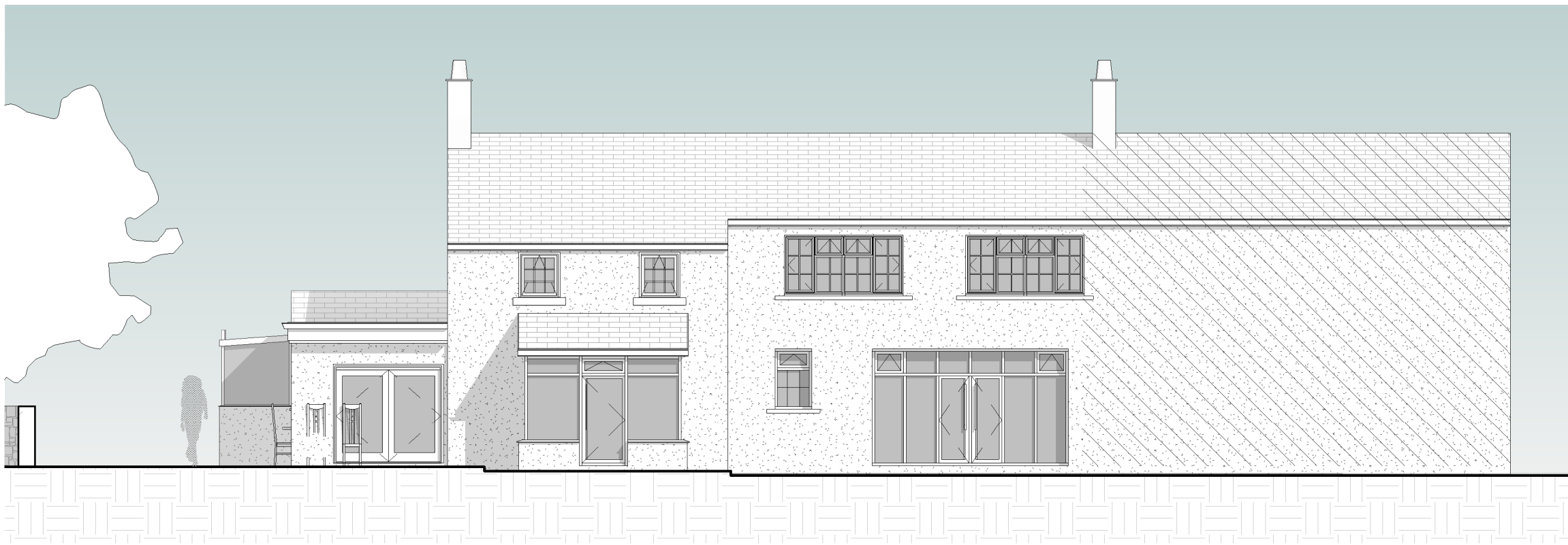
5 EXISTING NORTH WEST 1 : 100