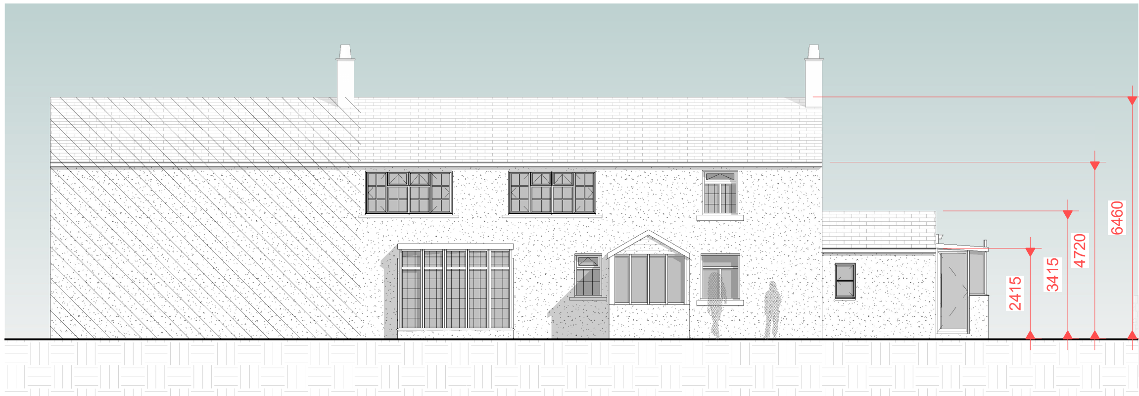
3 EXISTING SOUTH EAST 1 : 100