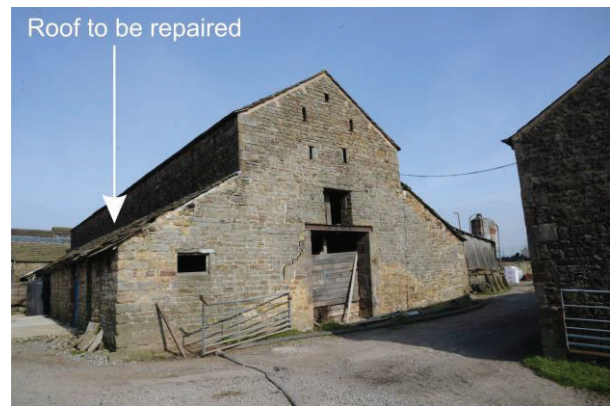
Plate 3 Southeast elevation of the barn

The southwest lean-to of the barn is in a deteriorating state of repair and requires re-roofing (Plate 3). The proposed works would involve the removal of the existing roof covering, replacement of any rotten timber components with replacement equivalents, and then covering the roof with a breathable membrane, fitting new softwood battens and re-roofing with the roof tiles set aside. Any shortfall in roof tiles would be filled using tiles of matched colour, size and appearance salvaged from elsewhere on the estate.