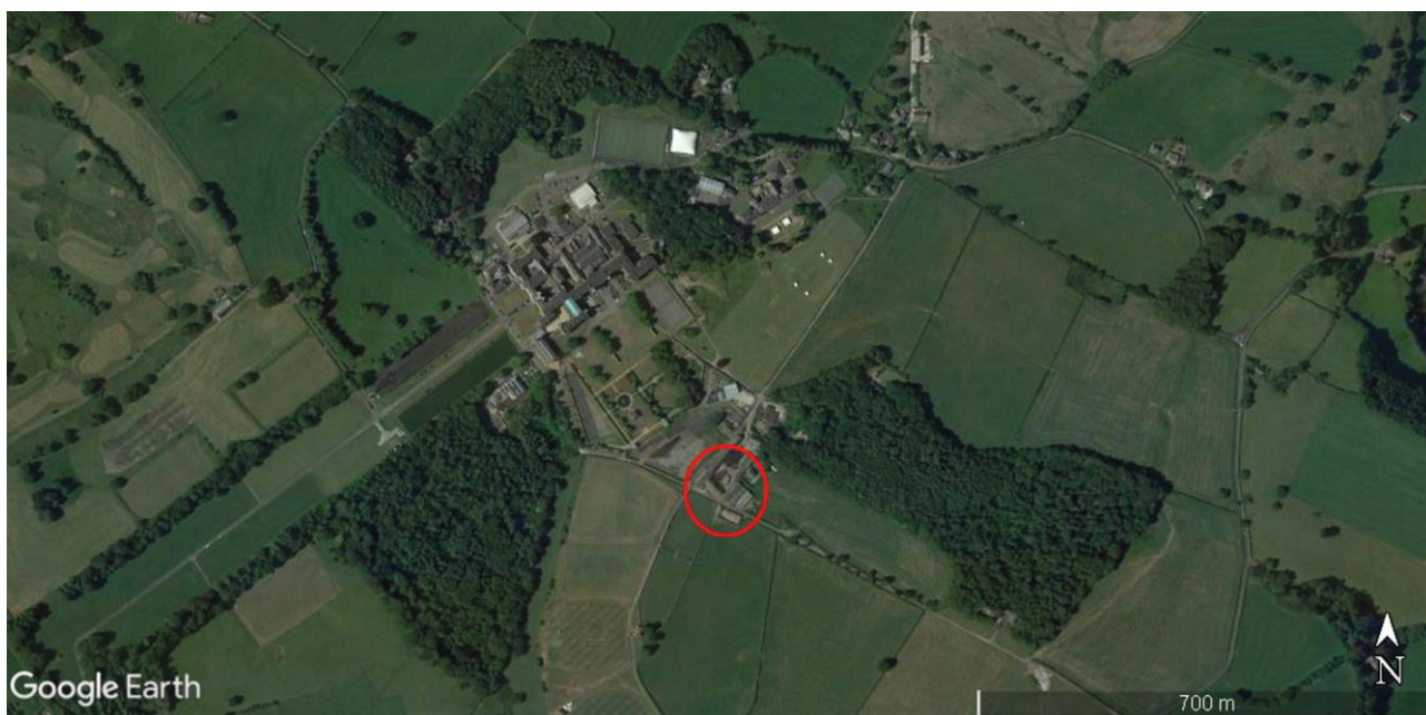
Plate 1 Aerial view of Stonyhurst College, with the site of barn

This document presents a Written Scheme of Investigation (WSI) for a programme of historic building recording to be carried out at Hall Barns Farm, Stonyhurst, Lancashire, prior to the repair of the roof to the southwestern outshut of a Grade II Listed Barn. The WSI has been prepared by FAS Heritage on behalf of Carter Jonas for the Stonyhurst Estate.