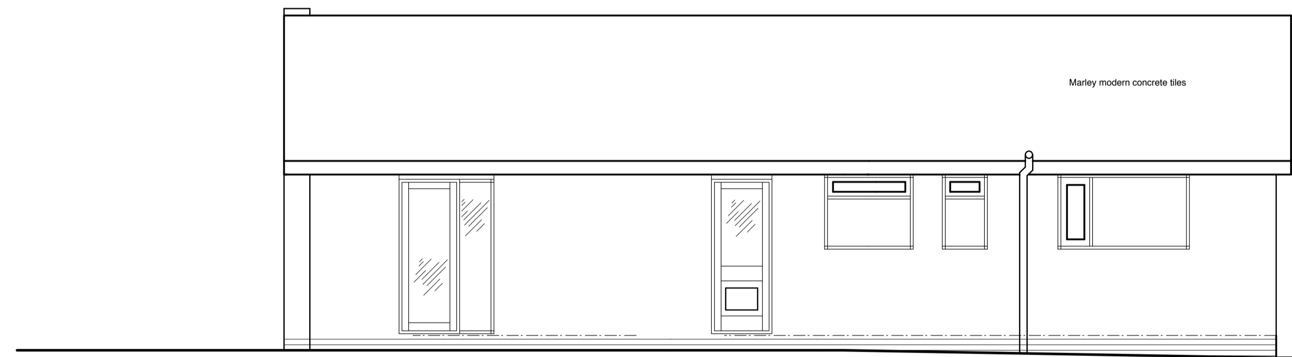
REAR ELEVATION ( EAST ) EXISTING

NEWHEY LOFT CONVERSIONS LLOYD STREET SAW MILLS HIGHER LLOYD STREET DARWEN telephone 07803 950606