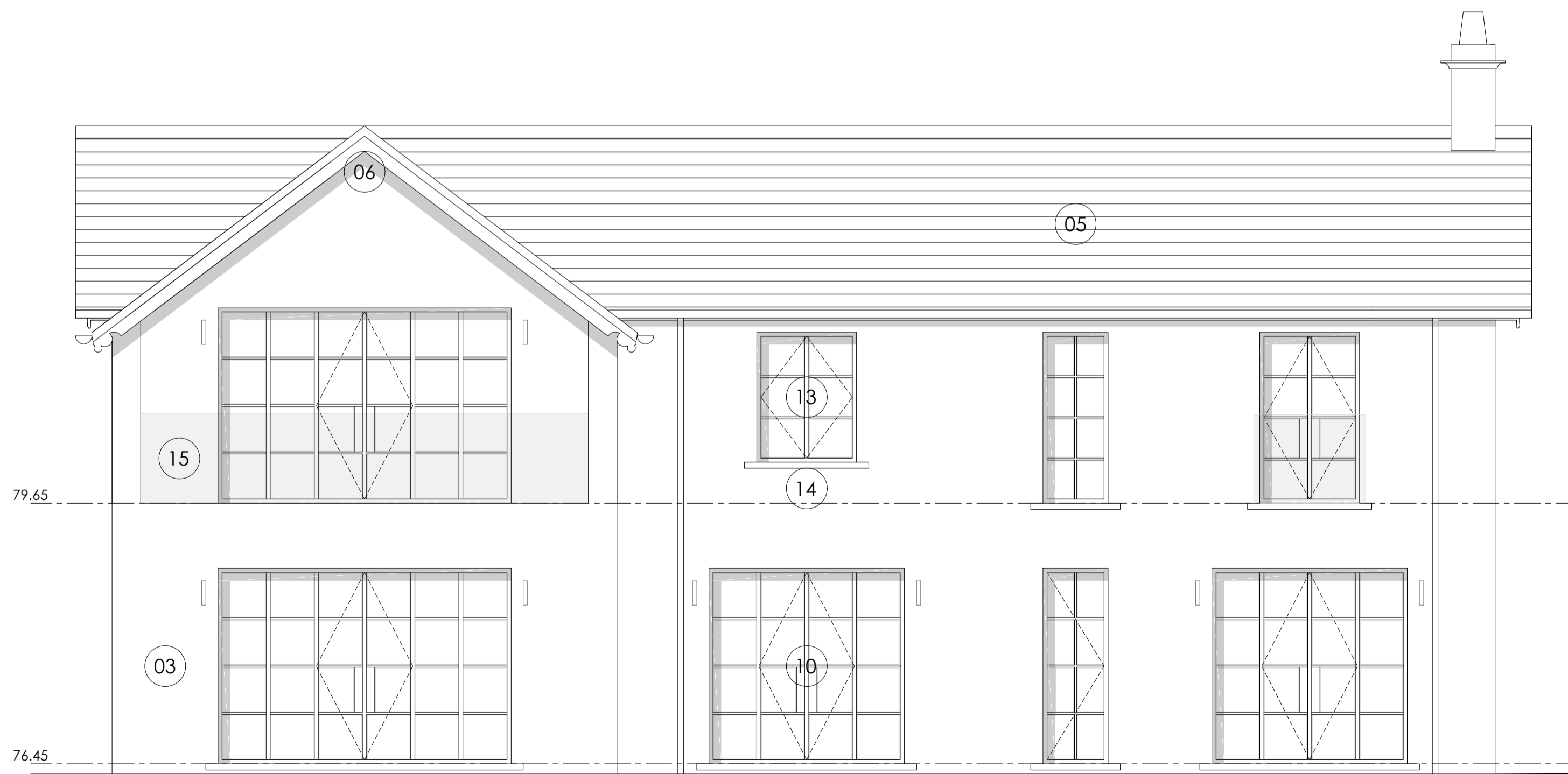
Proposed Rear Elevation Scale 1:50 @ A1