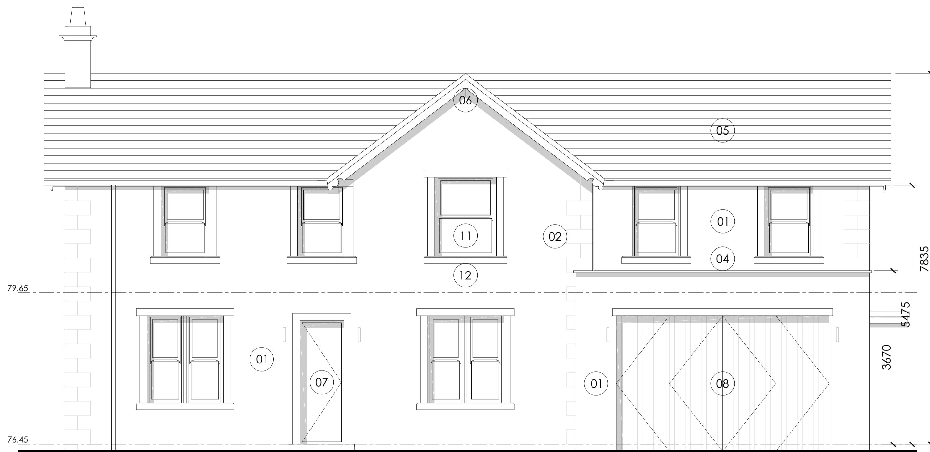
Proposed Front Elevation Scale 1:50 @ A1