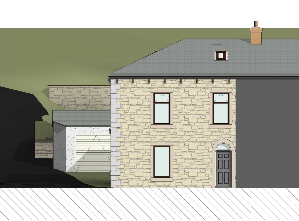
1 PROPOSED NORTH 1 : 100