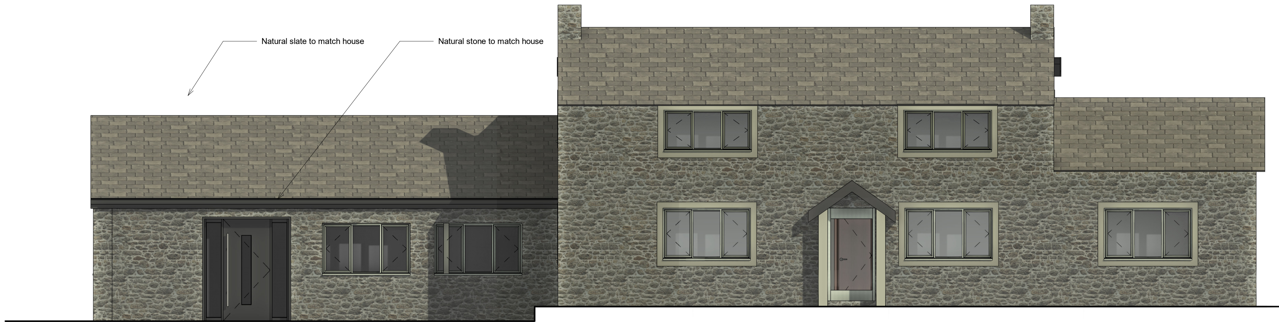
3 PROPOSED SOUTH 1 : 50