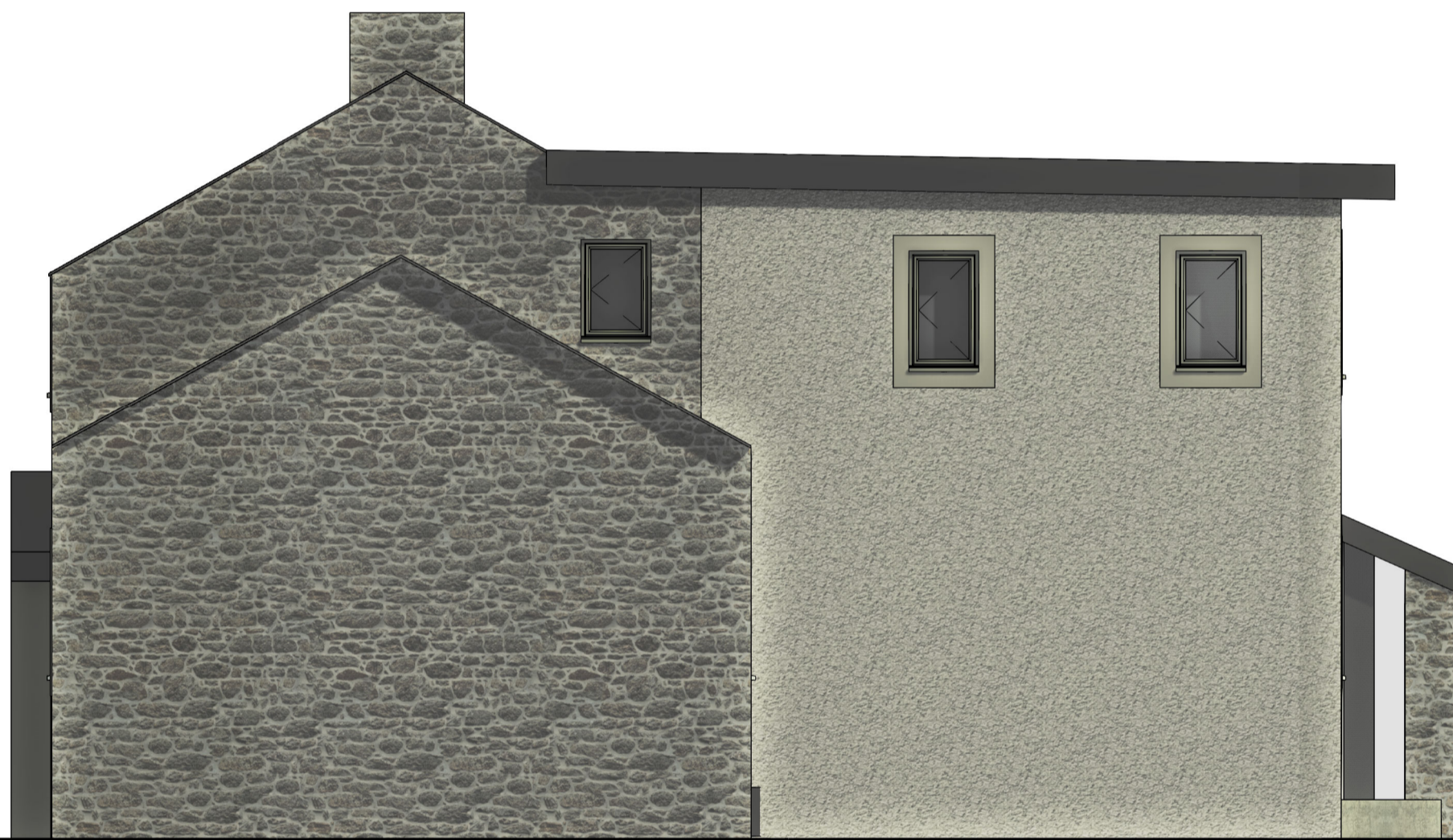
1 PROPOSED EAST 1 : 50