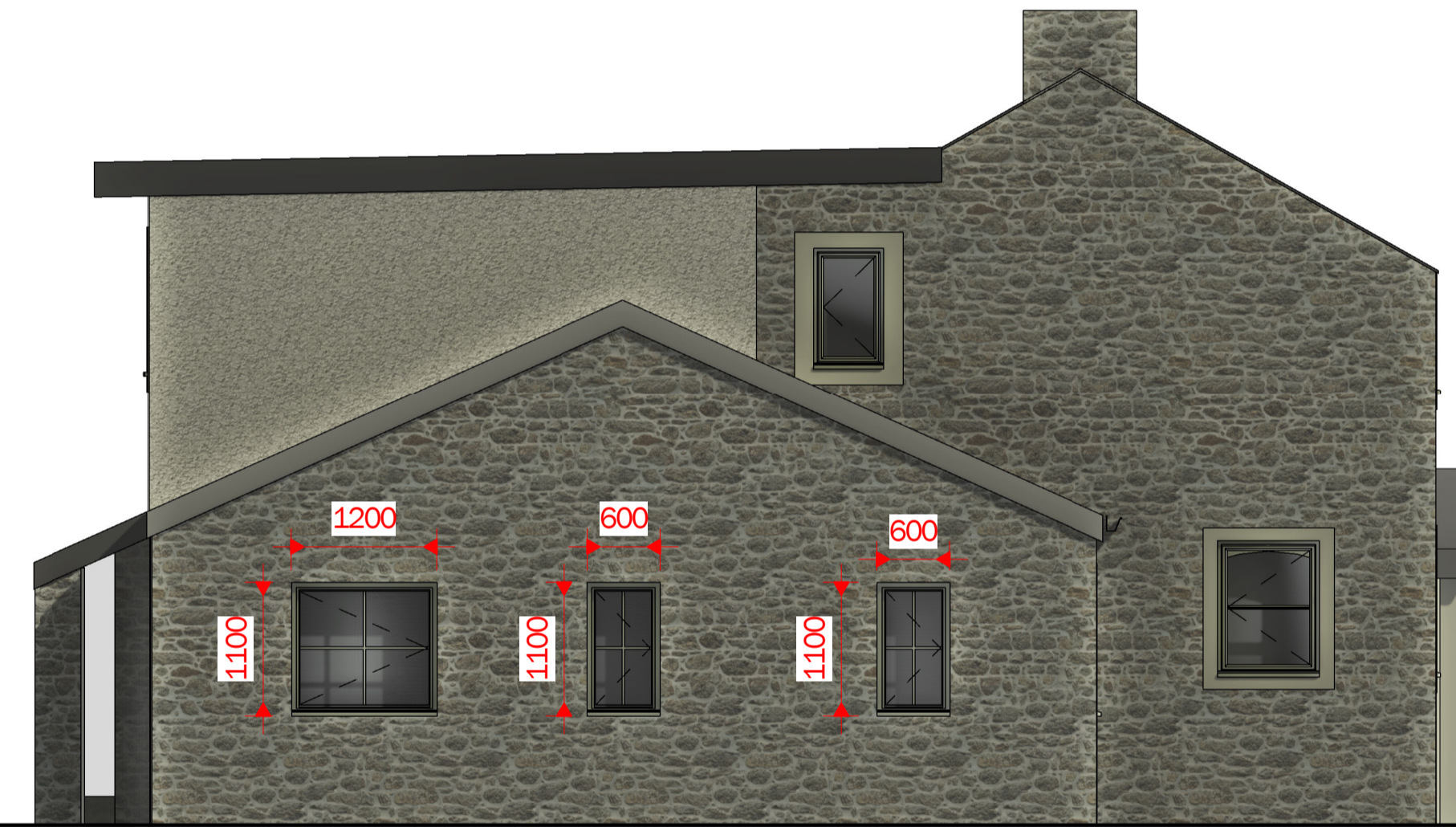
4 PROPOSED WEST 1 : 50