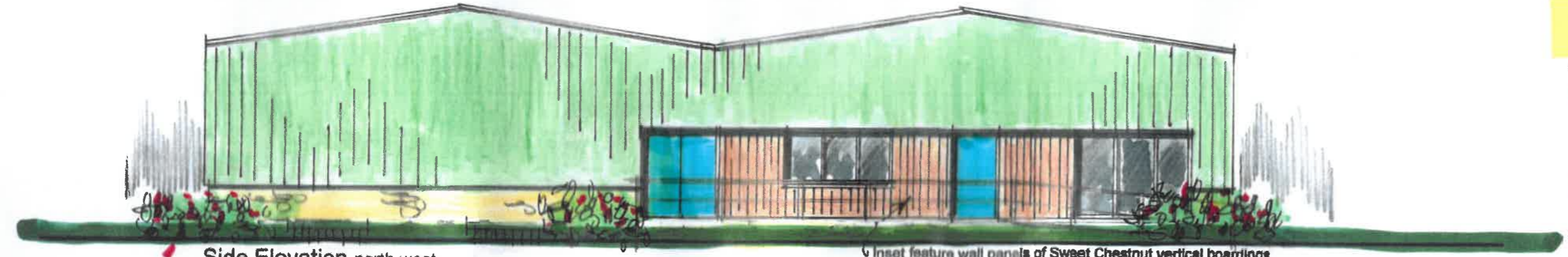
Side Elevation north west

Inset feature wall panels of Sweet Chestnut vertical boardings