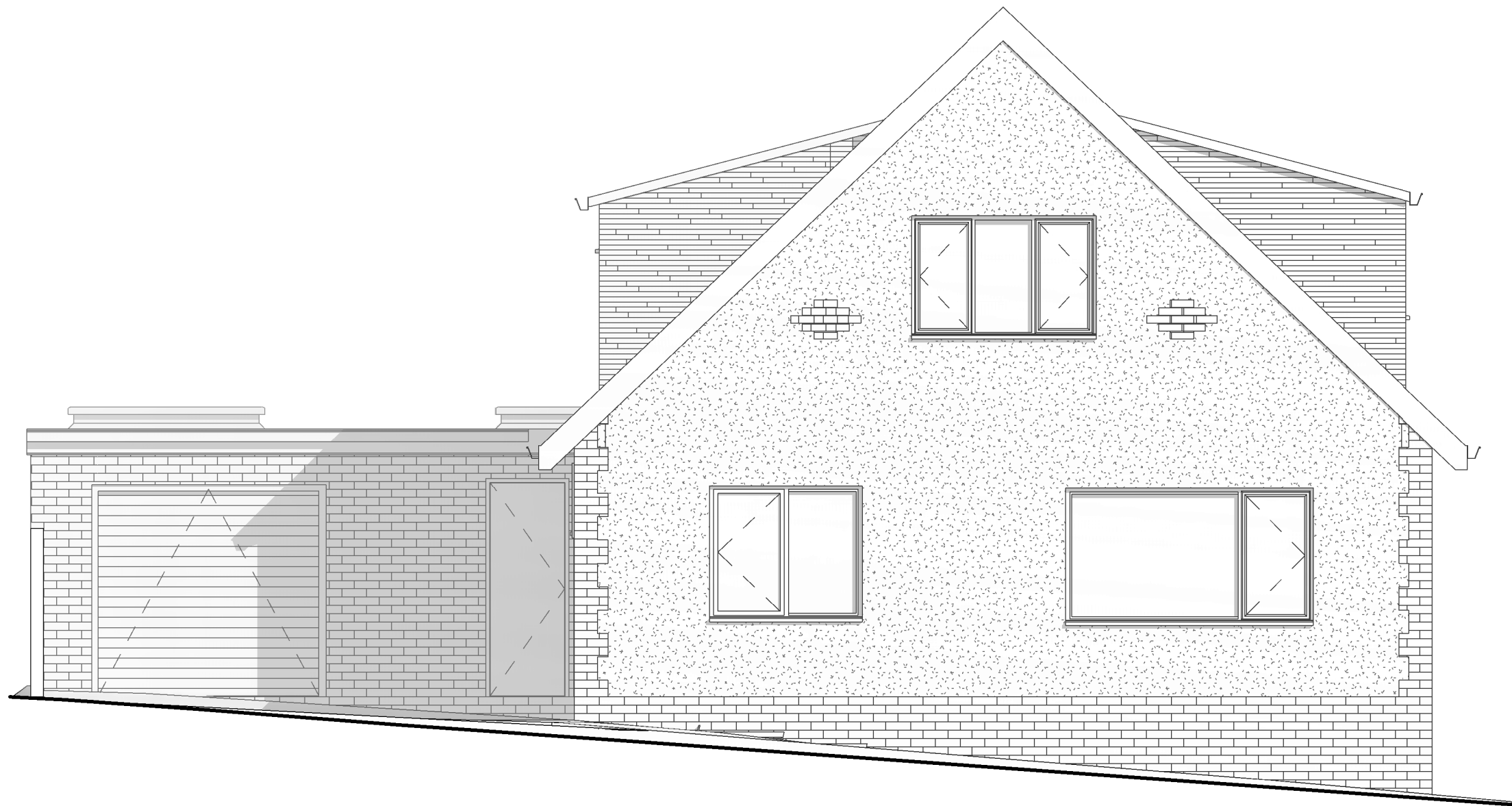
2 PROPOSED EAST 1 : 50