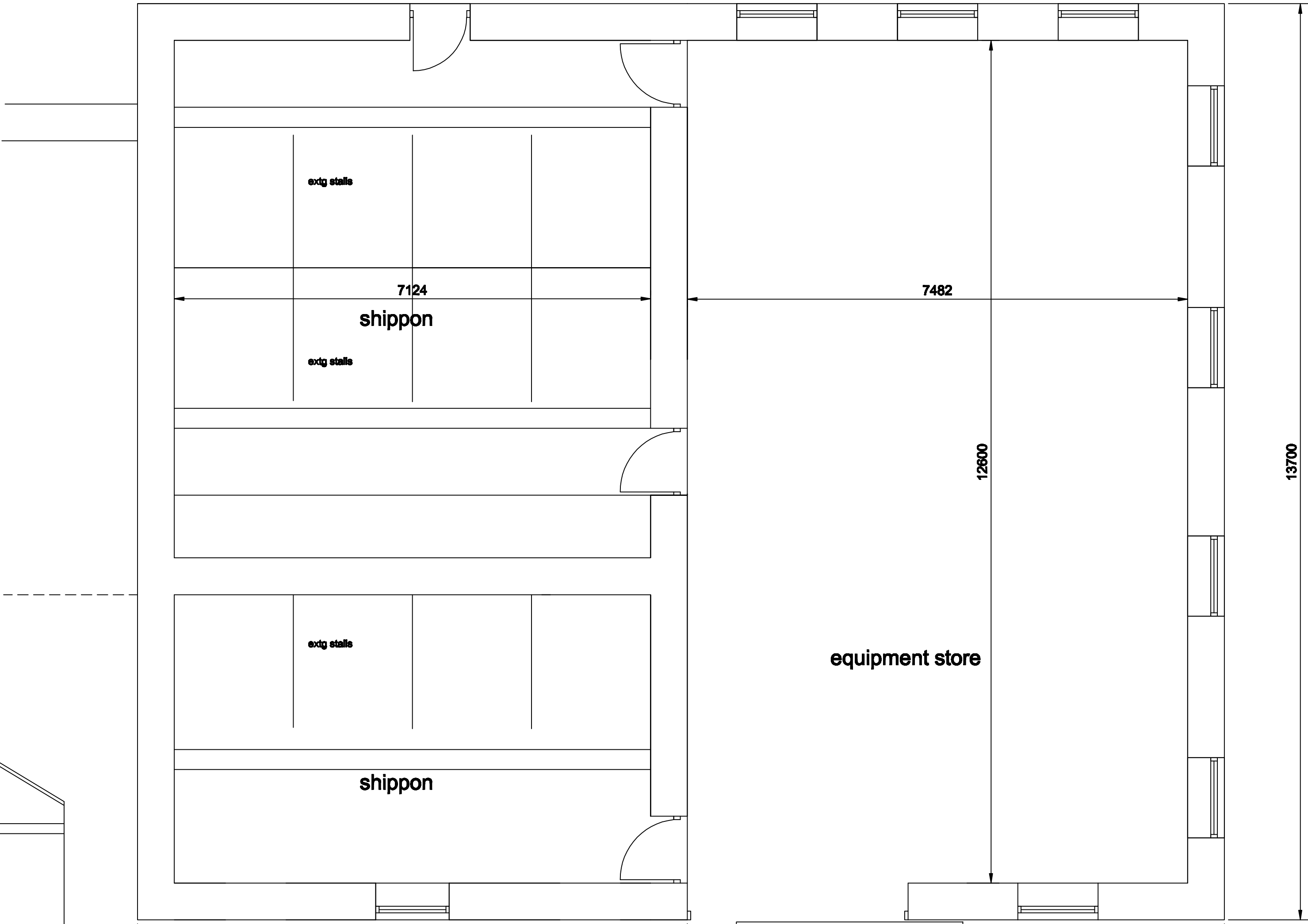
existing ground floor plan