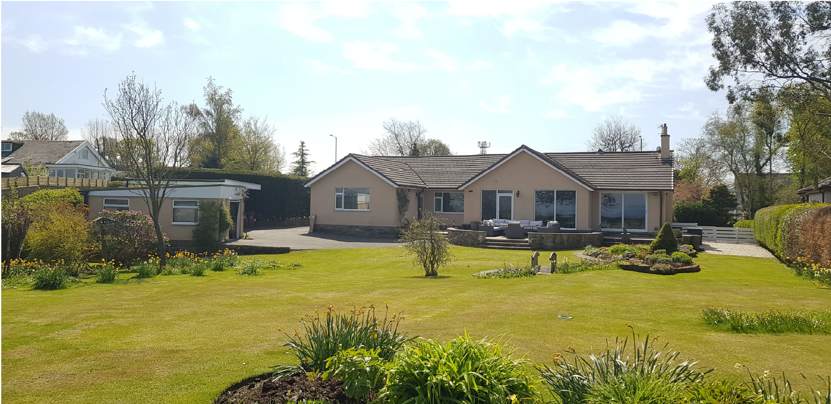
01 Existing Photograph Scale NTS @ A1