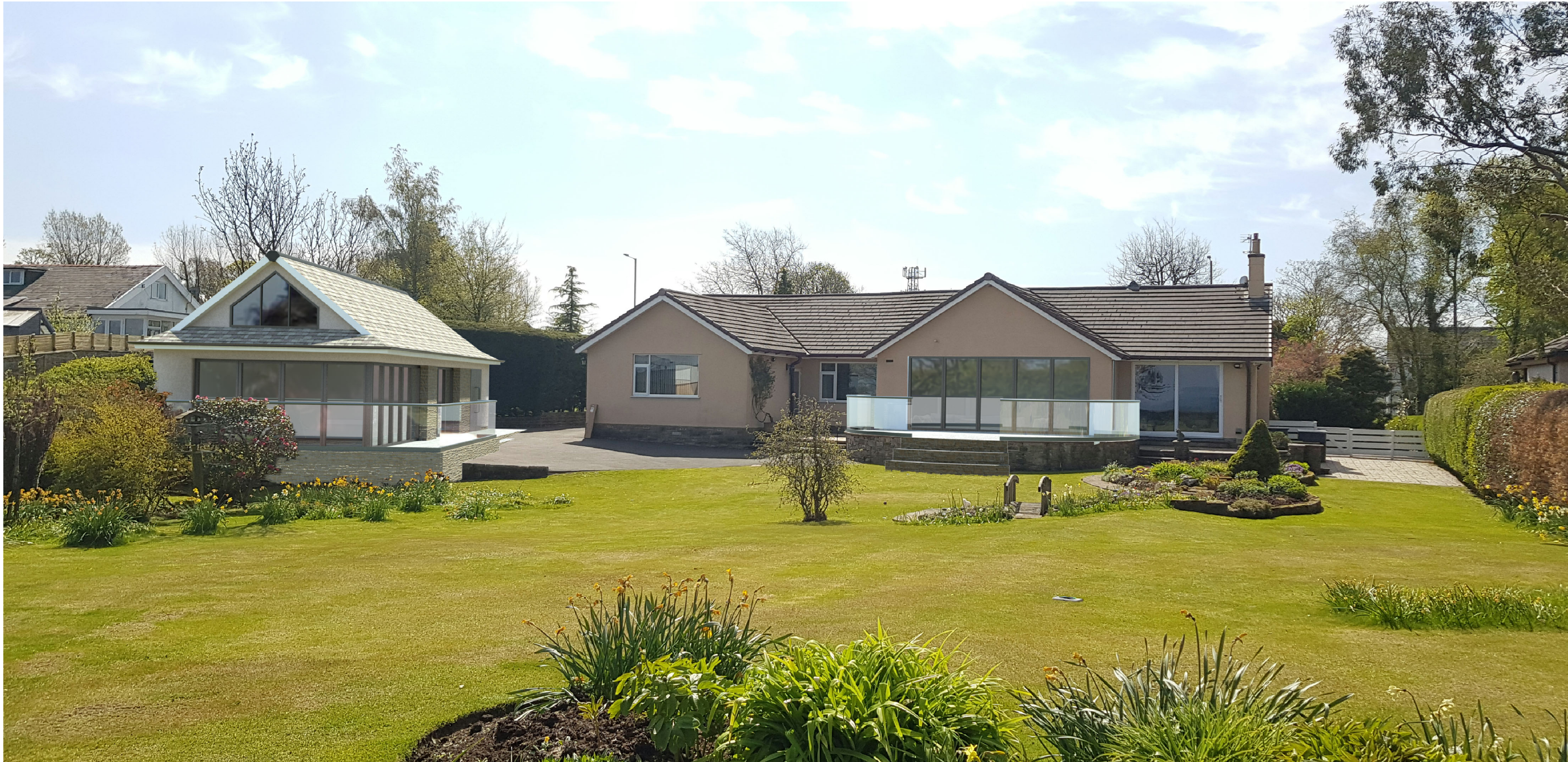
02 Proposed Visualisation Scale NTS @ A1