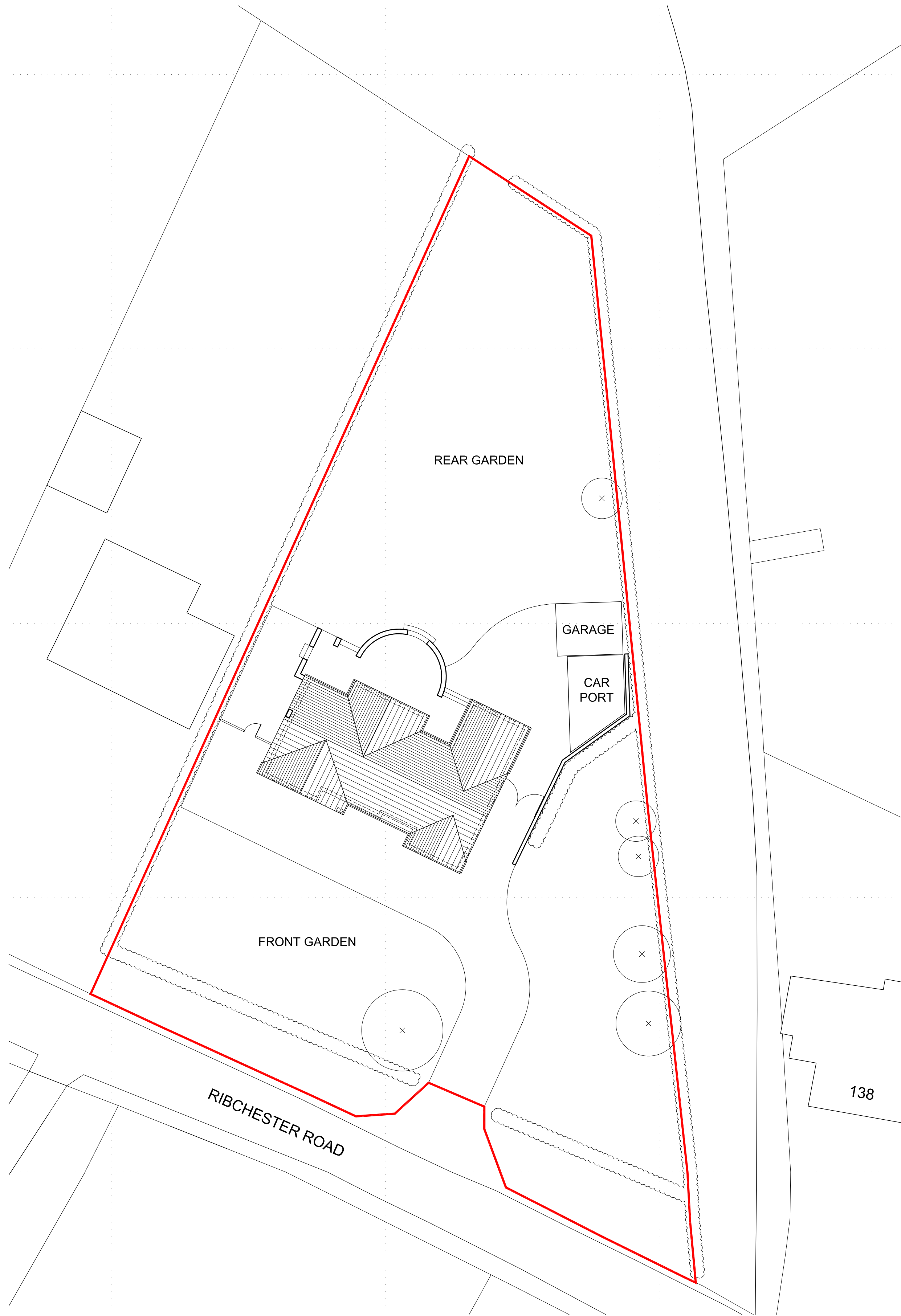
01 Existing Site Plan Scale 1:250 @ A1