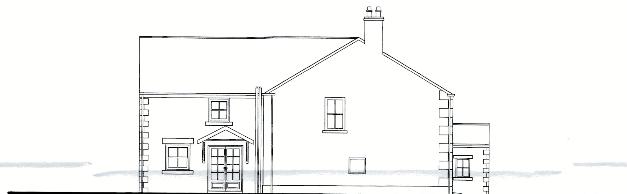
Side Elevation 2