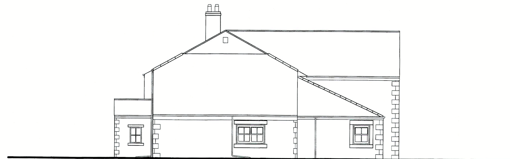
Side Elevation 1