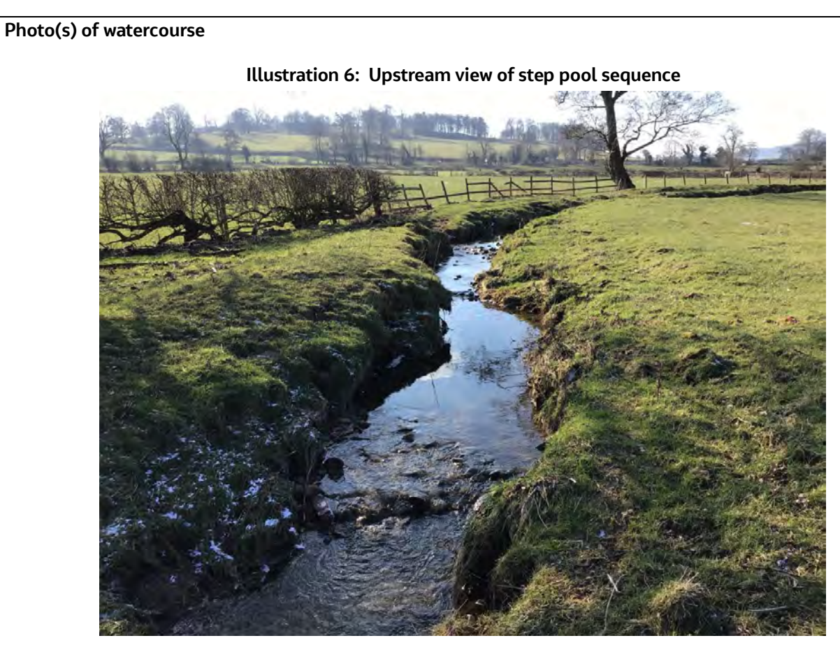
Illustration 7: Upstream view showing rubble on right bank and in channel