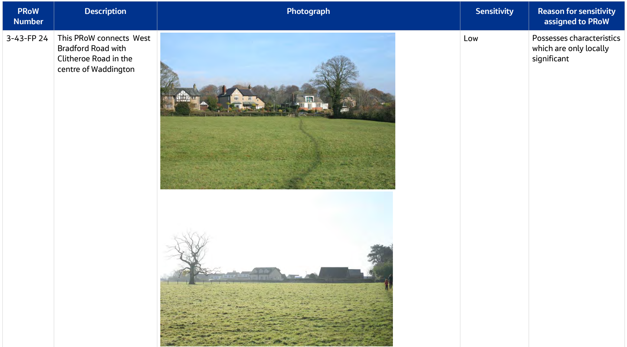
Table 1: Public Rights of Way Baseline Data