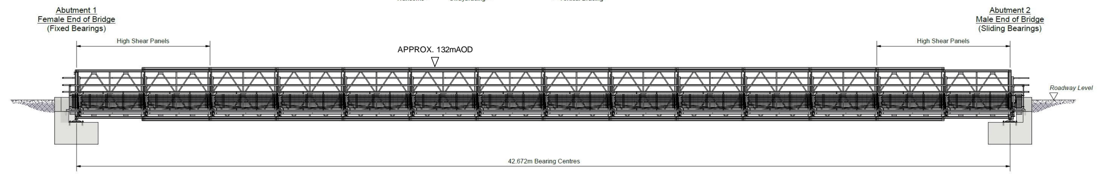
VIEW ON ARROW 'C' (NTS)