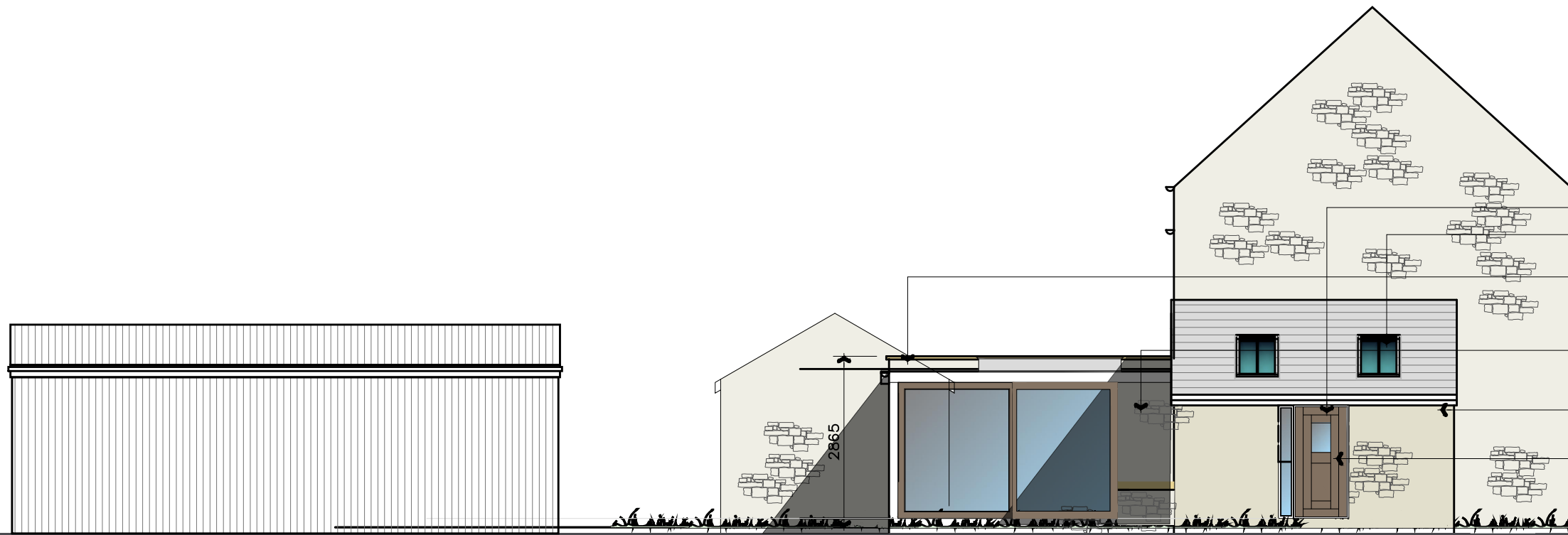
ELEVATION FROM THORNLEY-WITH-WHEATLEY