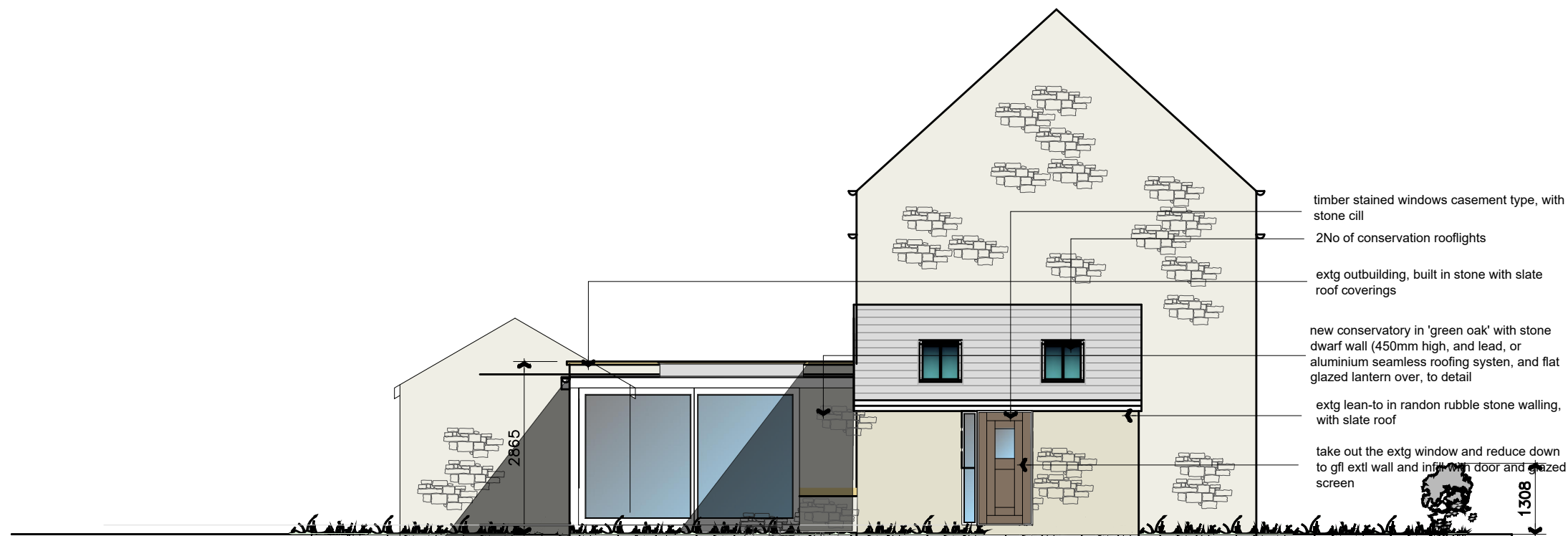
ELEVATION FROM THORNLEY-WITH-WHEATLEY