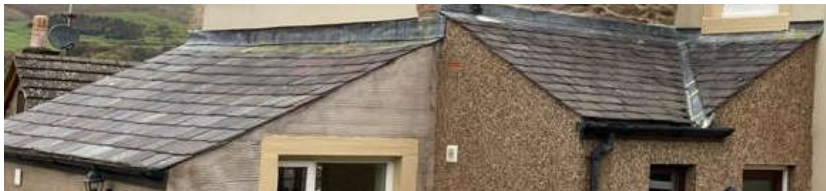
Extension lean to roofs