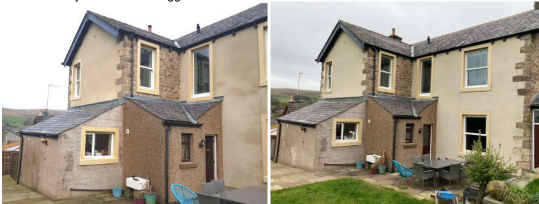
Part rear elevation showing outrigger and extensions

The property is a detached period house which has been extended at a later date with single storey rear extensions adjacent to the outrigger.