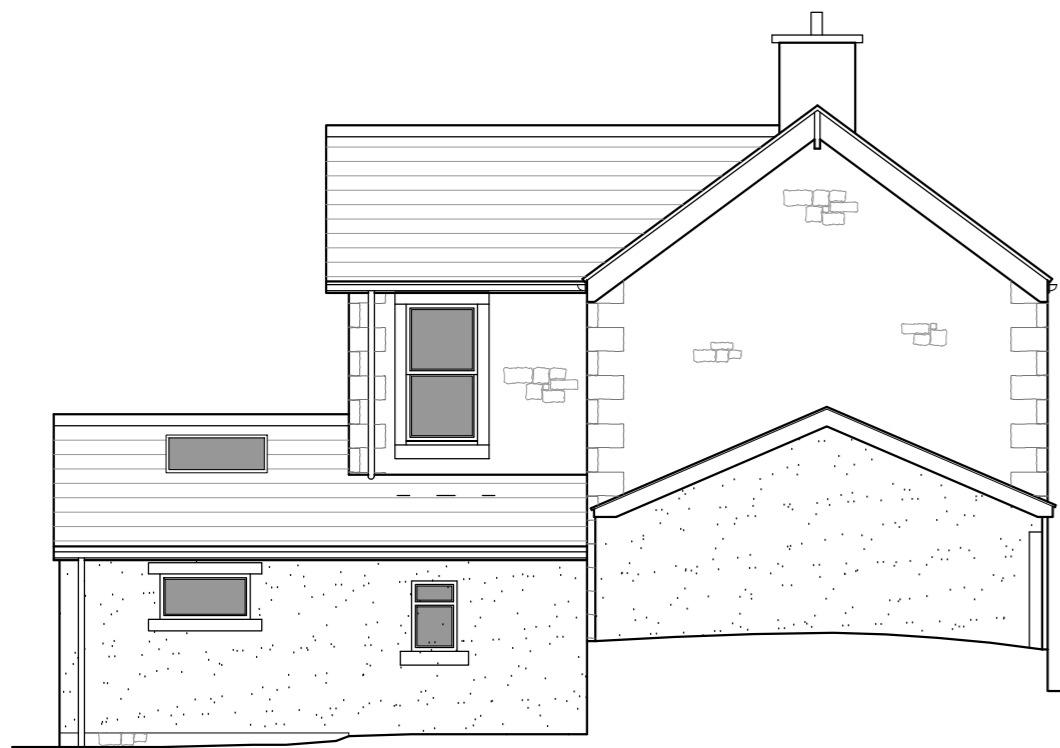
Side South Elevation 1:100