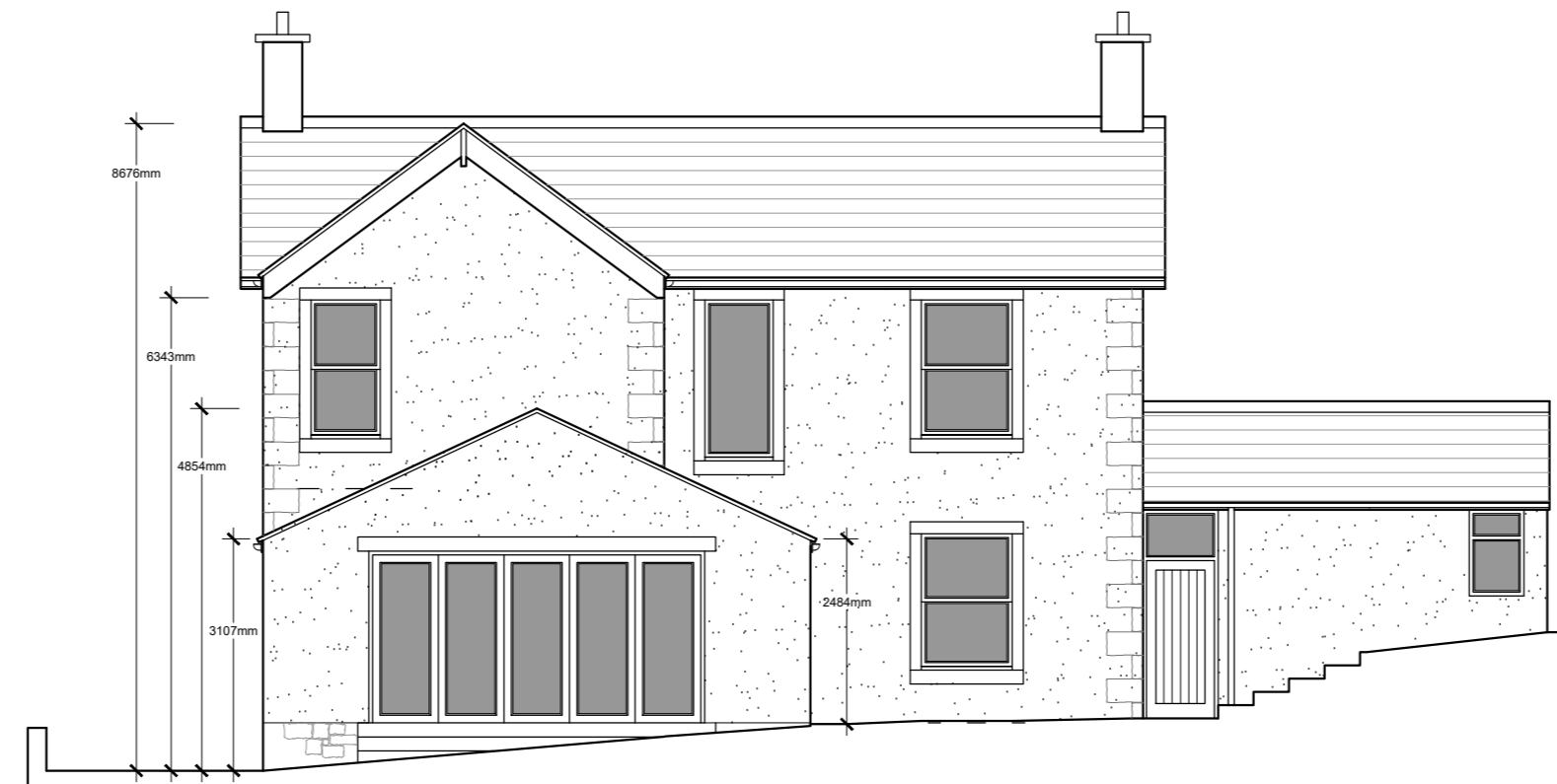
Rear West Elevation 1:100