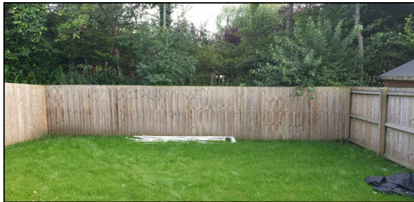
Existing View 02