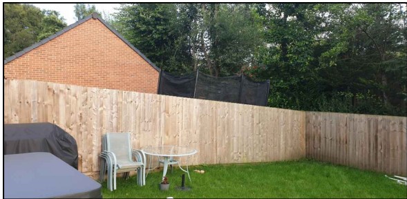
Existing View 01