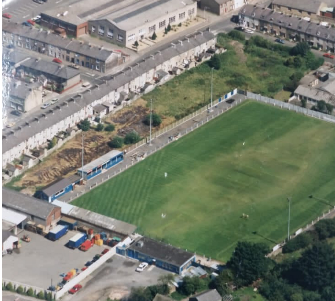
prior to development of new stands and housing on Bright street

Whilst it will vary season to season it is anticipated that the match parking will be required for 65 times per year or season.