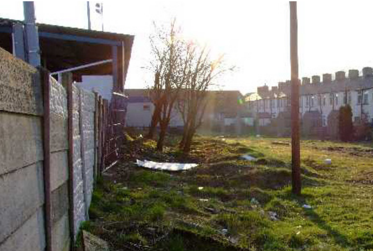
prior to recent works being undertaken