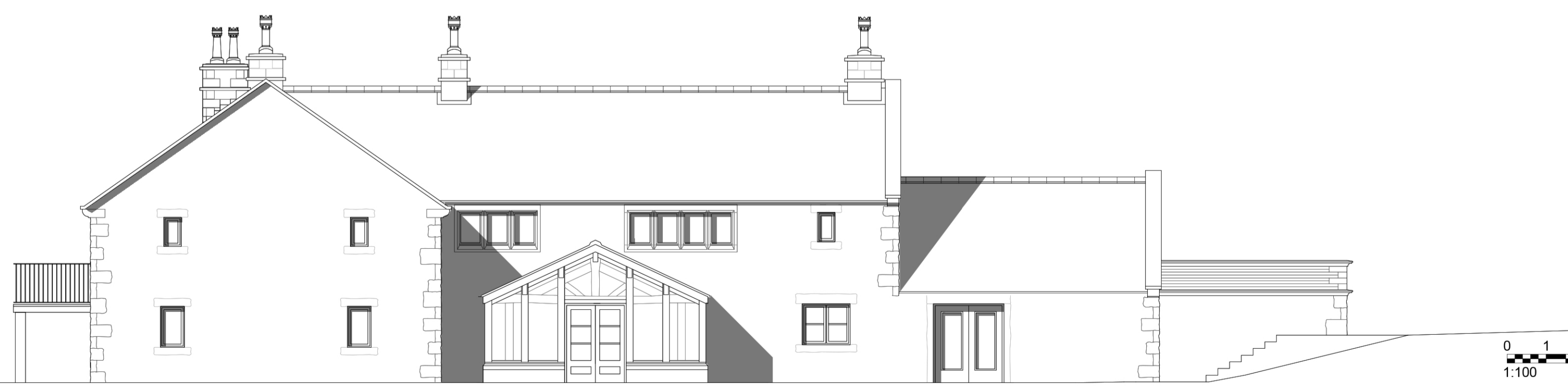
Existing Elevation C (East, Side) SCALE 1:100