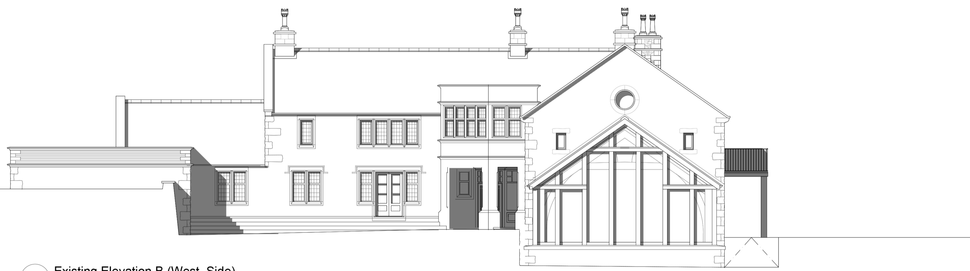
Existing Elevation B (West, Side) SCALE 1:100